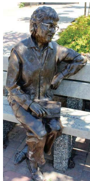
Statue of social worker and activist Bridget Moran in Prince George.