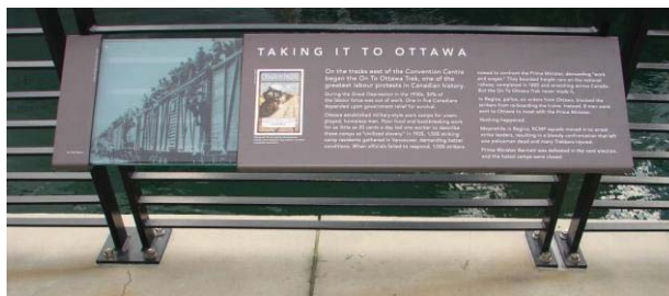
A series of plaques documenting events and people in British Columbia's labour history are on display at the Vancouver Convention Centre.

In 2010, the BC Labour Heritage Centre partnered with the Vancouver Convention Centre on the installation of a series of educational panels along the interior and exterior of the new Convention Centre. The Convention Centre covered the cost of producing the panels and we provided the research.