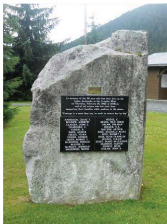
Plaque commemorating deaths of 26 miners at Granduc Mine, Stewart, BC.

Part of the Plaques Around the Province Project is the creation of an inventory of existing memorials that meet the same criteria. We are asking groups and individuals to make us aware of these commemorative locations. Two examples are shown below: