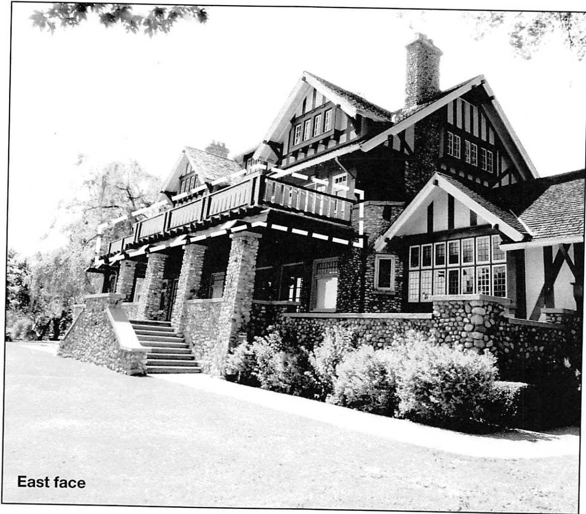
Ceperley Mansion "Fairacres" Upper east deck restoration