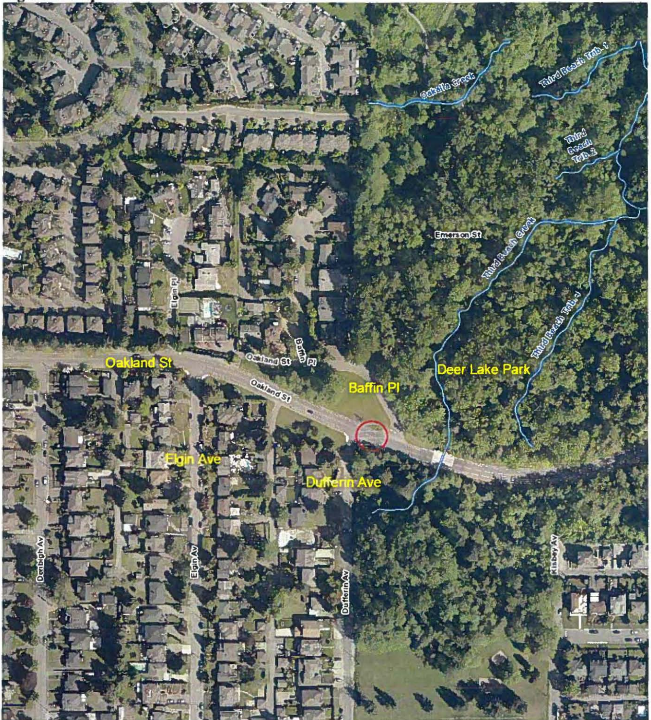
Figure 1: Requested Crosswalk Location

To: CHAIR AND MEMBERS PUBLIC SAFETY COMMITTEE From: DIRECTOR ENGINEERING Re: Crosswalk – Oakland St at Dufferin Ave 2017 April 05 ..... Page 2