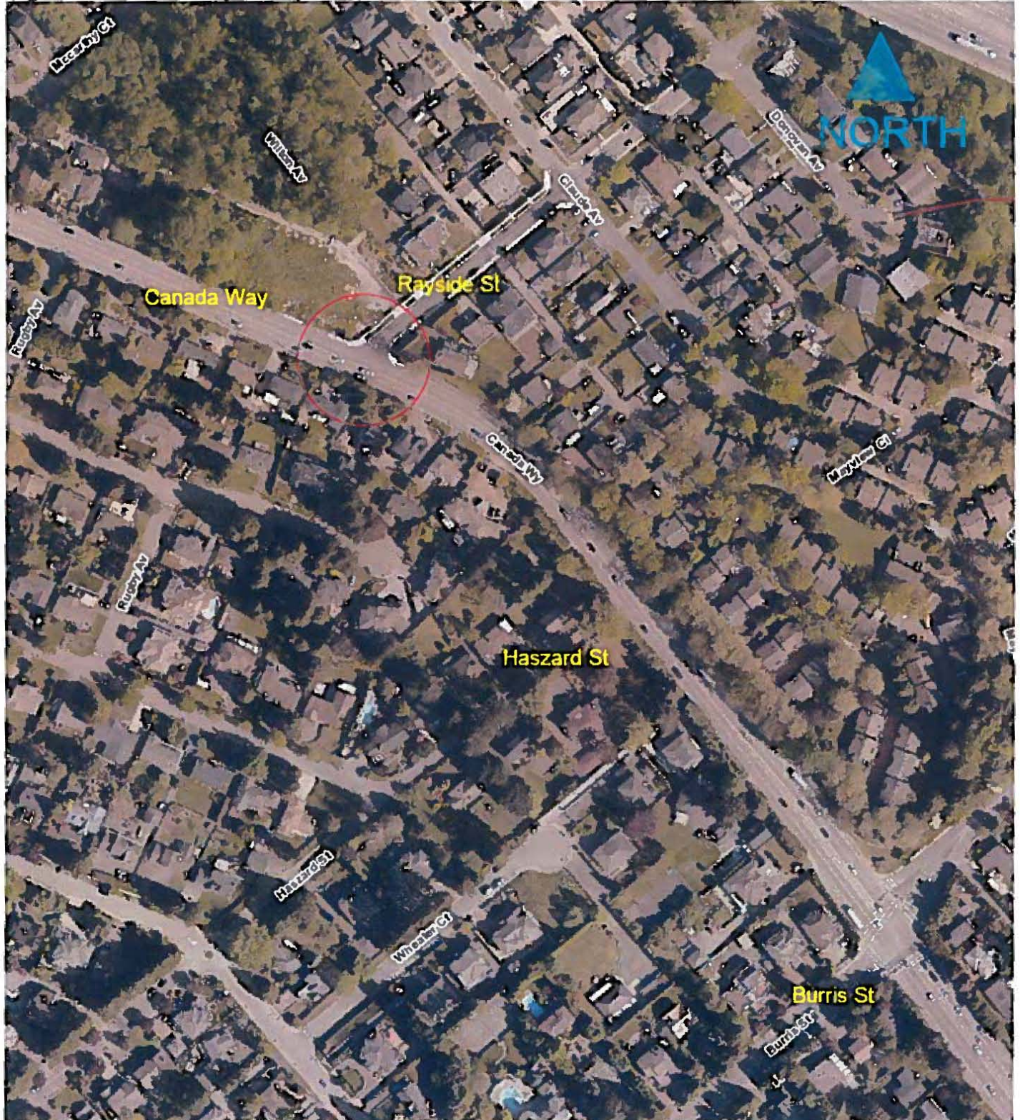
Figure 1: Canada Way at Rayside St

To: Public Safety Committee From: Director Engineering Re: Safety Countermeasures – Canada Way at Rayside Street 2017 April 25 ..... Page 2