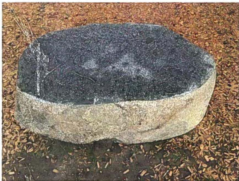
South Slope Elementary School