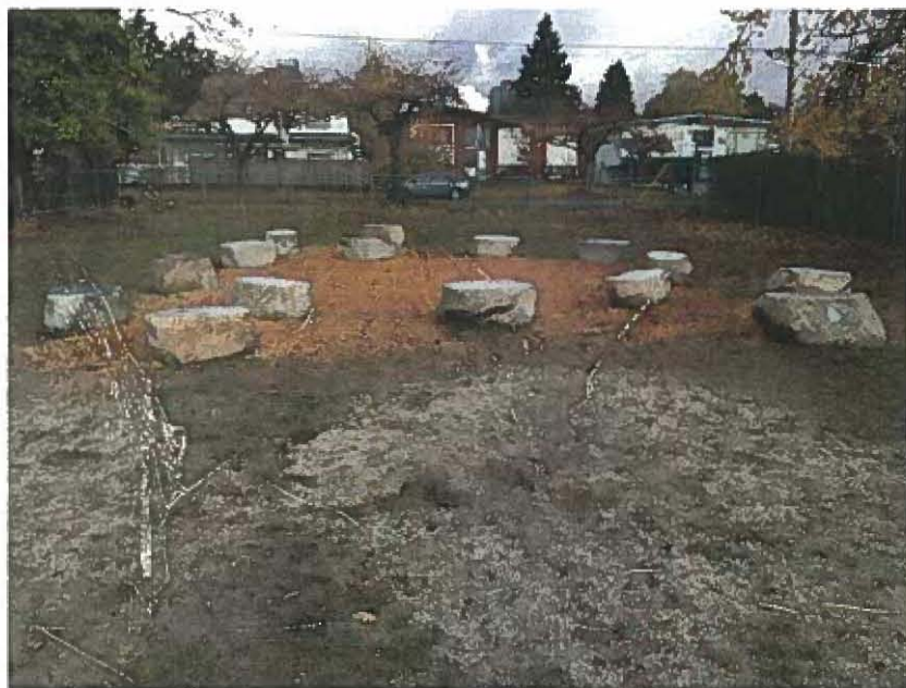
South Slope Elementary School