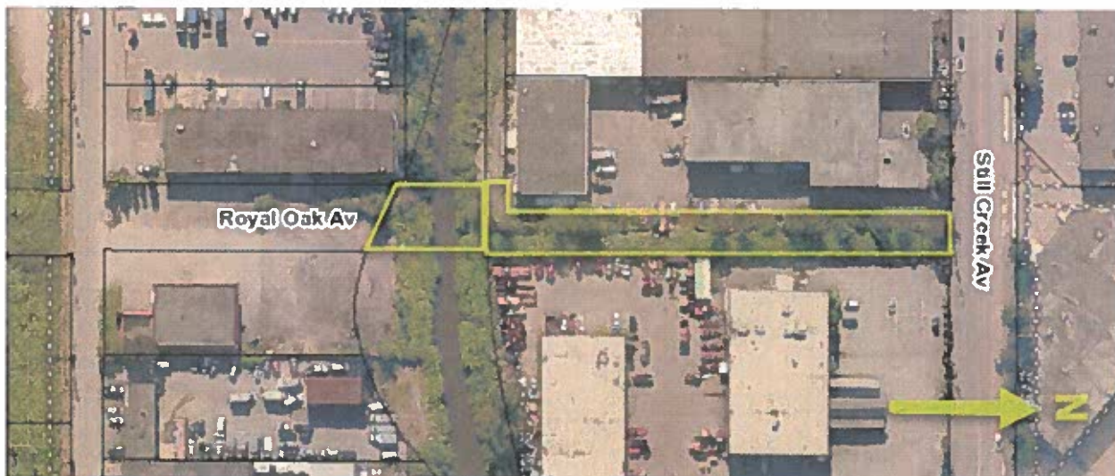
Figure 2 – Location of proposed Metro Vancouver watermain under Elk Creek

With respect to Project M1 – Still Creek Area, Metro Vancouver plans to install their watermain via deep micro-tunneling under Elk Creek, between Still Creek Avenue and Still Creek, in order to eliminate any environmental disturbance to this watercourse. Figure 2 shows Metro Vancouver's proposed watermain in relation to Elk Creek. Metro Vancouver has submitted and received approval from the City's Environmental Review Committee (ERC) on 2017 December 11 that this is an acceptable construction methodology.