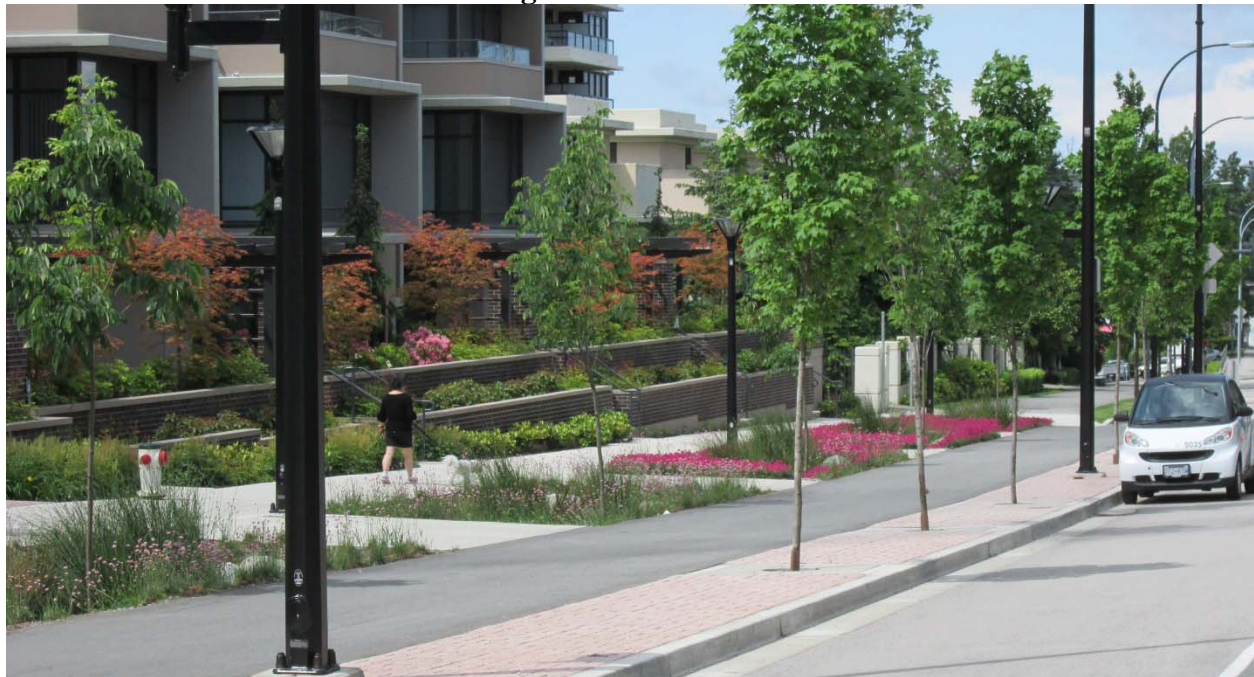
Figure 6: Bike Path

The designs incorporate bike paths which are physically separated from traffic as shown in Figure 6 . These provide a greater sense of comfort and safety for all users. Most cyclists ride for recreation or errands, and the bike paths are designed to facilitate slower, local trips within each Town Centre. This design supports cycling by those, such as children or infrequent cyclists, who are not comfortable in traffic. Each bike path is separated from pedestrians by the centre boulevard treatment and from car doors by the front boulevard, discussed below. Bike racks are provided on private property and/or on the crossings of the centre boulevard.