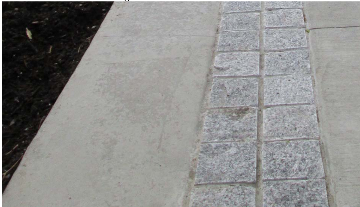
Figure 3: Border of Inset Pavers

Rain gardens are bordered by low, ornamental railings ( Figure 2 ) and inset pavers ( Figure 3 ). These attractive features provide visual guidance to pedestrians and protect the landscaping. The width of the centre boulevard and the direction of rain water to that area both support larger trees that create a street tree canopy for shade, comfort, and enjoyment. The centre boulevard also provides the location for dark-sky compliant pedestrian-oriented lighting fixtures, shown in Figure 2 .