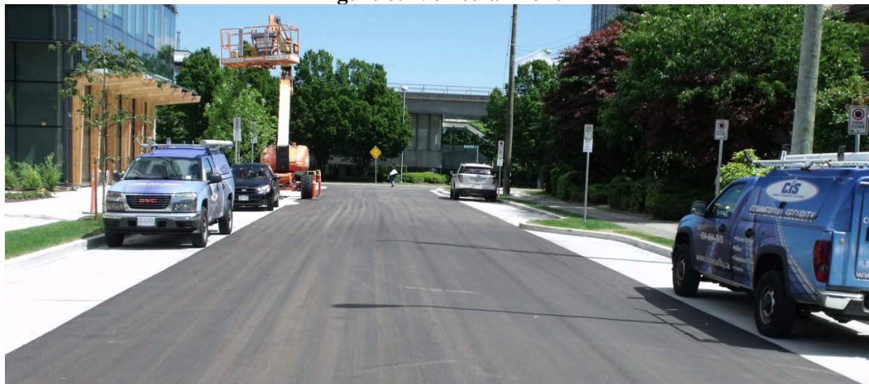
Figure 8: Vehicular Zone

The above summarizes the design features that have been included in Town Centre public realm standards, as developed to date.