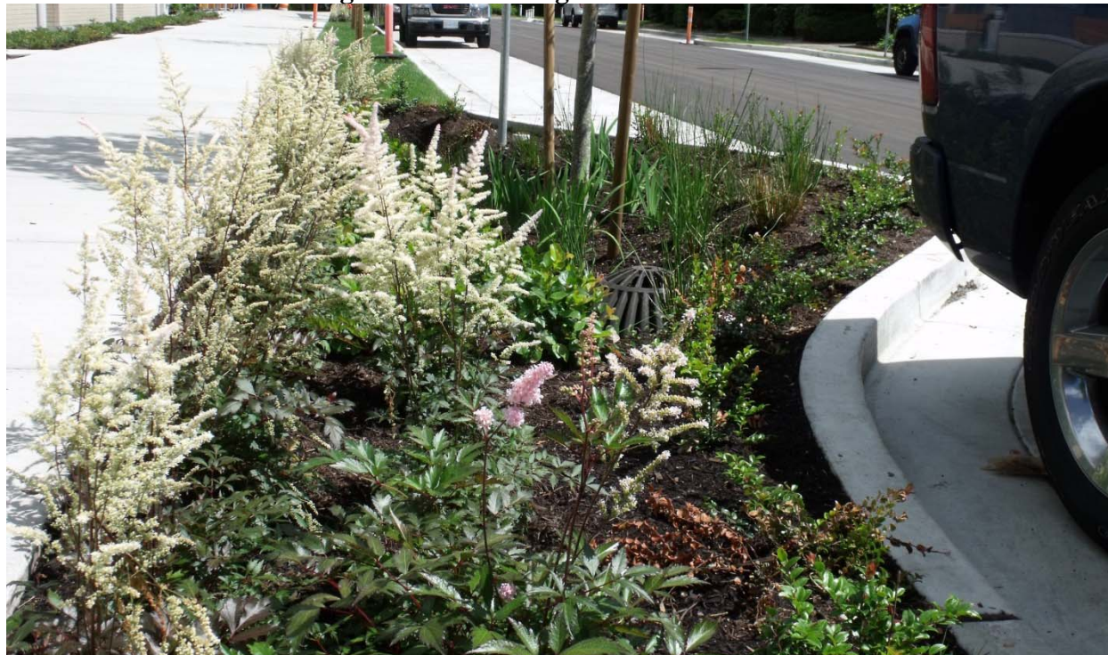
Figure 7: Curb Bulge with Rain Garden

At bus stops, the centre boulevard rain gardens are omitted and the bike path is shifted into the centre boulevard area, allowing for expansion of the front boulevard. This creates a generous space for a bus shelter and the increased pedestrian activity that is seen at these locations. Where ever possible, stops include a bench, shelter, lighting, and are wheelchair-accessible. Other desirable features (not at every stop) include bus schedule information, waste/recycling receptacles, newspaper boxes, public art, and a nearby marked crosswalk.