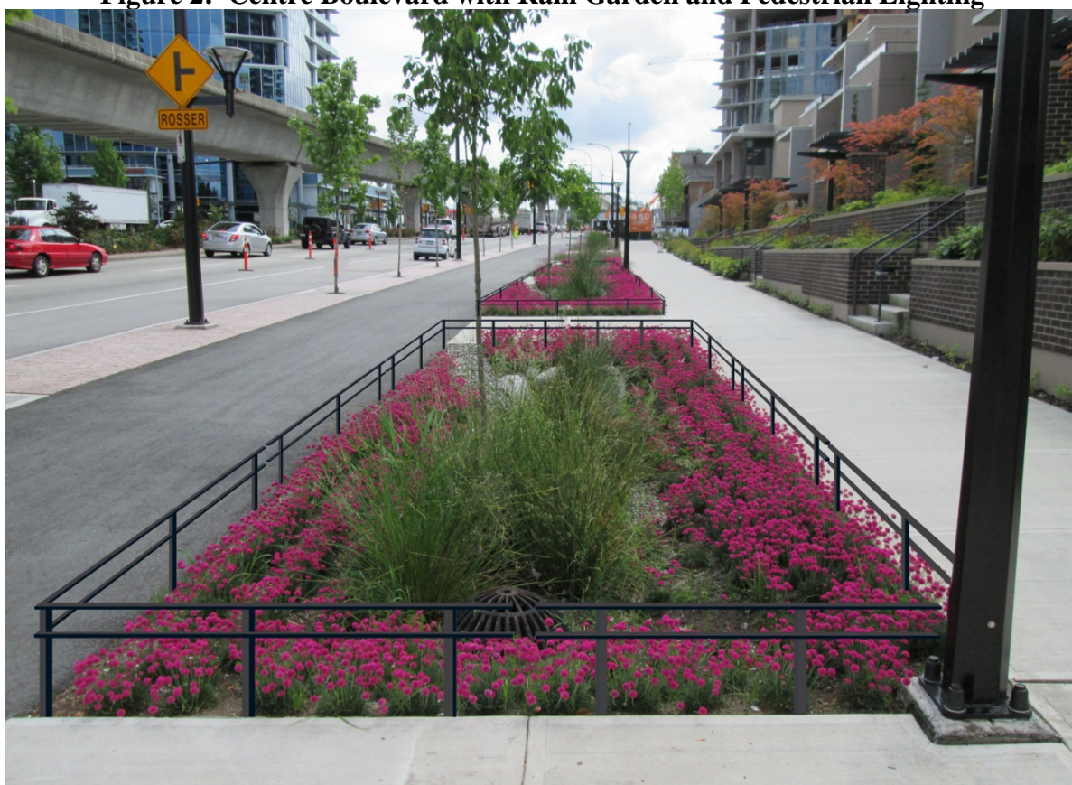
Figure 2: Centre Boulevard with Rain Garden and Pedestrian Lighting

The primary landscaping in this area is with trees, shrubs, and grasses. This area is designed to assist with management of rain runoff originating within the road allowance. A facility that combines rainwater management with landscaping is referred to as a “rain garden”. These typically incorporate the following functions in support of goals stated in the City’s Integrated Stormwater Management Plans .