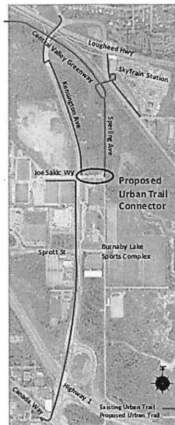
Figure 3: Burnaby Lake Urban Trails

The trail provides local community access and connection to the Bill Copeland Sports Centre, CG Brown Memorial Pool, Burnaby Lake, Burnaby Lake Sports Complex, Deer Lake Park and Civic Complex, Central Valley Greenway, Sperling / Burnaby Lake SkyTrain Station and bus stops. This short section is the missing pedestrian and cyclist link in existing Urban Trails extending from Canada Way to the Lougheed Highway ( Figure 3 ), and would provide safe means for users to connect east-west.