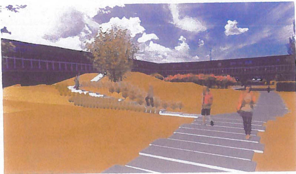
FIGURE 1 – SFU QUADRANGLE PYRAMID