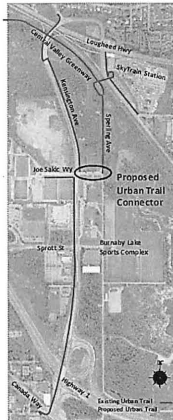
Figure 3: Burnaby Lake Urban Trails

The trail provides local community access and connection to the Bill Copeland Sports Centre, CG Brown Memorial Pool, Burnaby Lake, Burnaby Lake Sports Complex, Deer Lake Park and Civic Complex, Central Valley Greenway, Sperling / Burnaby Lake SkyTrain Station and bus stops. This short section is the missing pedestrian and cyclist link in existing Urban Trails extending from Canada Way to the Lougheed Highway ( Figure 3 ), and would provide safe means for users to connect east-west.