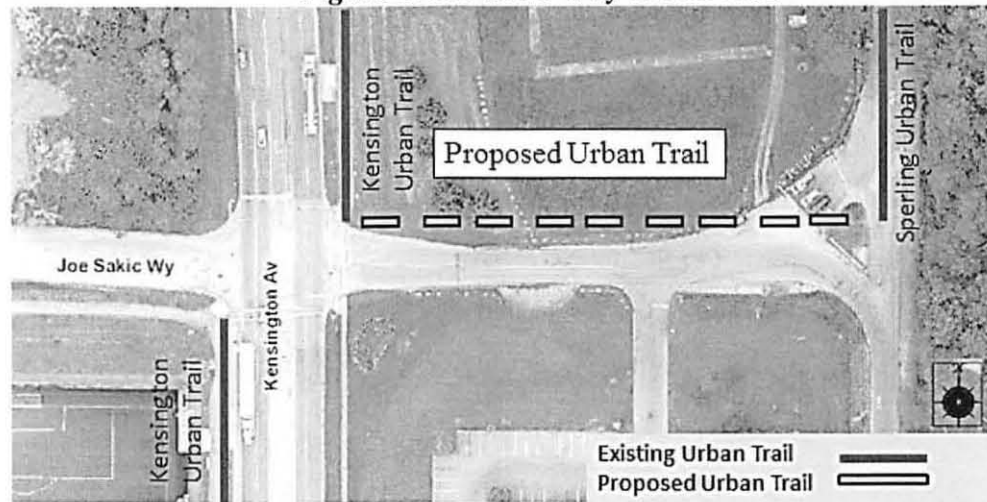
Figure 2: Joe Sakic Way Urban Trail

The trail provides local community access and connection to the Bill Copeland Sports Centre, CG Brown Memorial Pool, Burnaby Lake, Burnaby Lake Sports Complex, Deer Lake Park and Civic Complex, Central Valley Greenway, Sperling / Burnaby Lake SkyTrain Station and bus stops. This short section is the missing pedestrian and cyclist link in existing Urban Trails extending from Canada Way to the Lougheed Highway ( Figure 3 ), and would provide safe means for users to connect east-west.