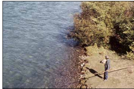
Photo left: Fishing for salmon near Fish Lake, BC (Gary Fiegehen), right: Protest against mining in Clayoquot Sound (Joe Foy).

The proposed Ajax mine is opposed by many residents because it is considered to be too close to where people live, work and go to school. Concerns over dust, toxic materials, water use, tailings spills and daily blasting make mining a non-starter so close to one of BC's major cities. 32