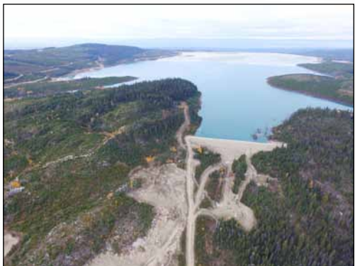
Photo: Gibraltar Copper-Molybdenum Mine tailings pond.