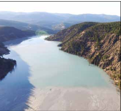
Photo left: Copper Mountain Mine tailings pond, right: Fraser River, BC.