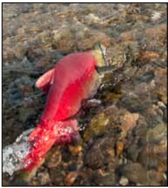
Photo left: Wild sockeye salmon in Adams River, BC, right: Devastation after the Samarco mine disaster in Brazil.

The river was already suffering by 1964, when the Mt. Washington Copper Company set up in the upper Tsolum watershed.