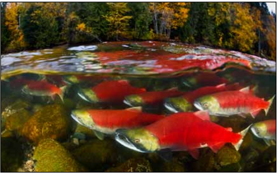
Photos left to right: Hazeltime Creek, post-Mount Polley mine spill, wild sockeye salmon.