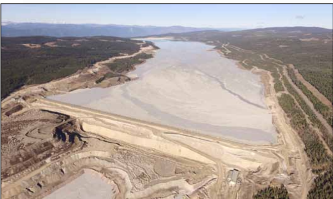
Photo: Highland Valley Copper Mine tailings pond (Jeremy Sean Williams).