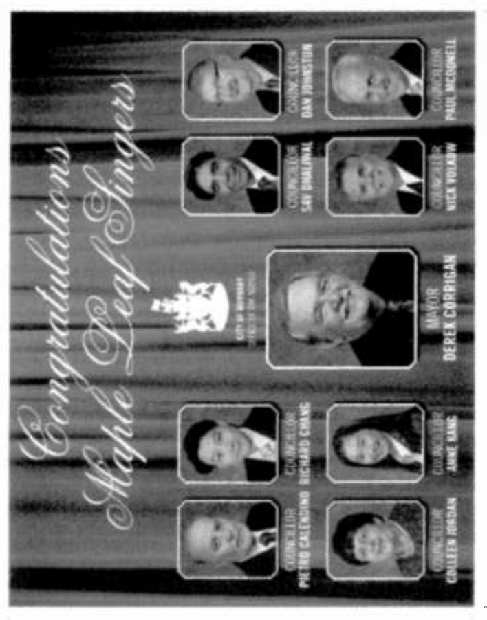
1/2 page 4.5×3.5