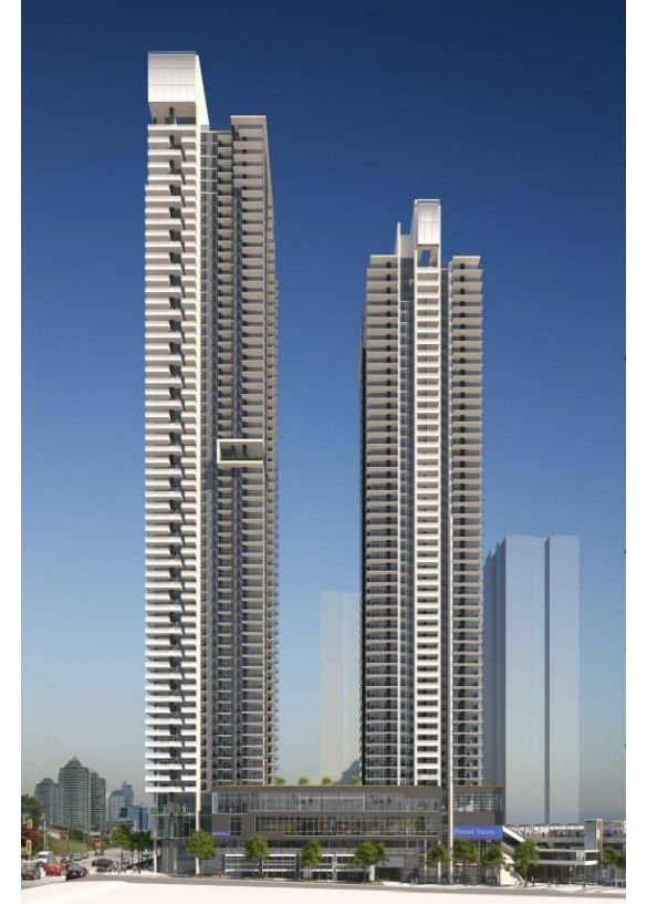
Figure #3 – Towers I - III

The proposed tower design complements the quality and timelessness of the commercial and public open space components advanced under Rezoning Reference #15-54. Tower I and Tower III are designed in tandem to support the signature tower at the corner of Gilmore Avenue and Lougheed Highway. Tower I and Tower III are the counterpoint to Tower II in the use of dark and light colours, drawing from a charcoal and white motif. The subject tower is distinct from the other two towers in that it breaks up the verticality by using offset balconies with fritted balcony glass in a zipper like pattern. The tower