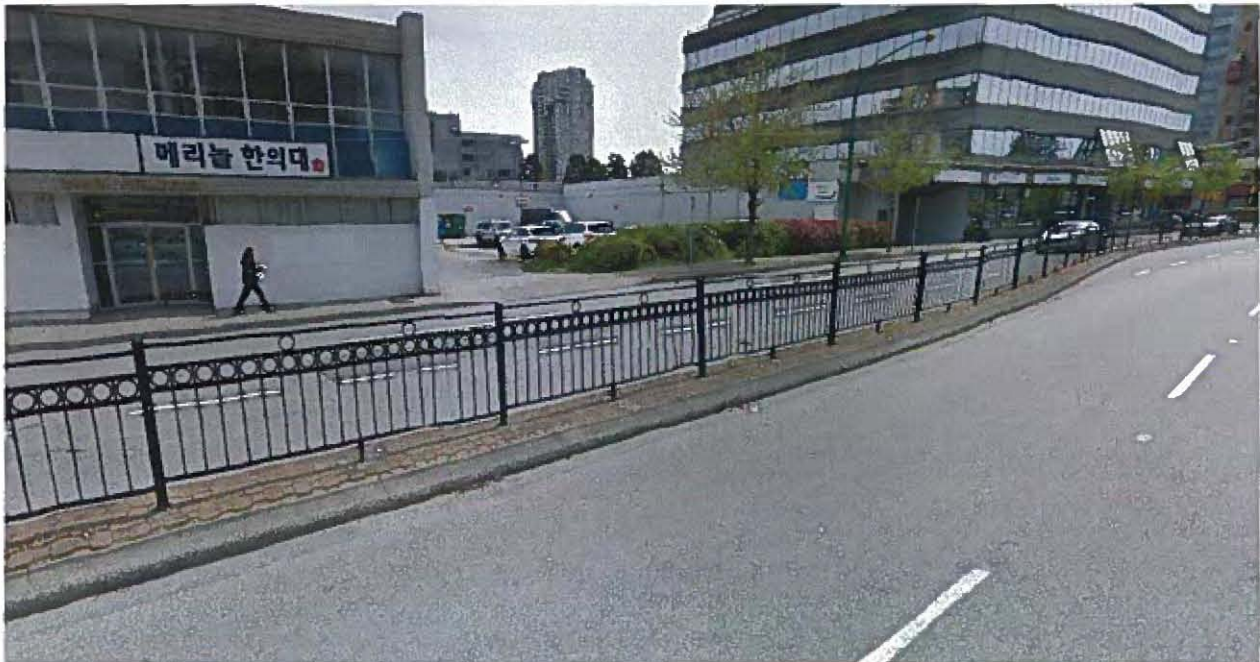
Figure 2 – Existing median fencing along Nelson Ave.