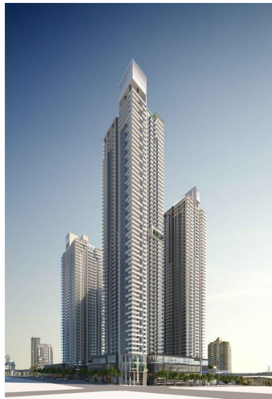
Figure #3 – Towers I - III