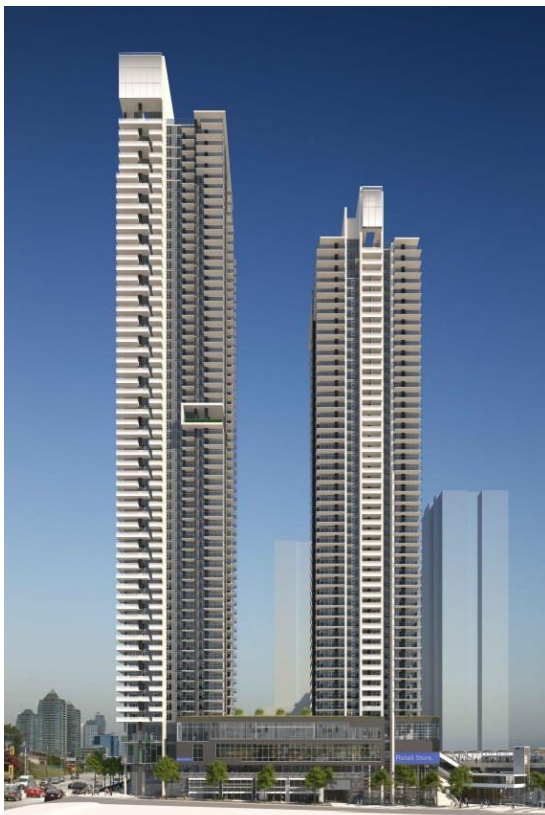
Figure #2 – Towers I & II

The proposed tower design complements the quality and timelessness of the commercial and public open space components advanced under Rezoning Reference #15-54. Tower I and Tower III are designed in tandem to support the signature tower at the corner of Gilmore Avenue and Lougheed Highway. Tower I and Tower III are the counterpoint to Tower II in the use of dark and light colours, drawing from a charcoal and white motif. The subject tower is elegant in its use of long vertical lines connecting the lobby space to a distinctive lantern feature at the top of the building oriented toward the west.