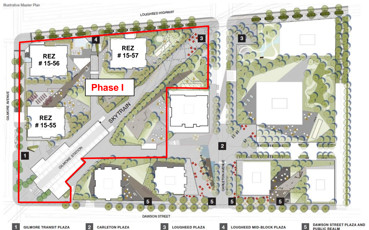
Figure #1 – Conceptual Master Plan