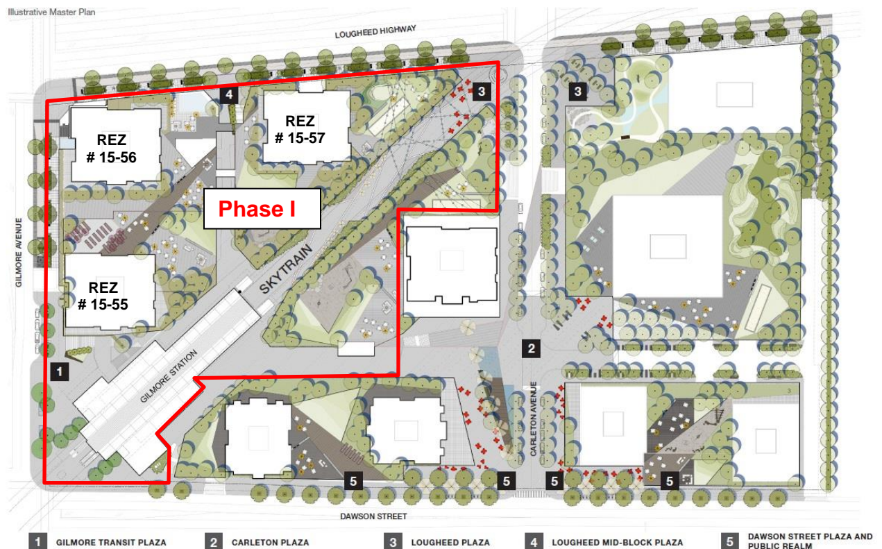
Figure #1 – Conceptual Master Plan