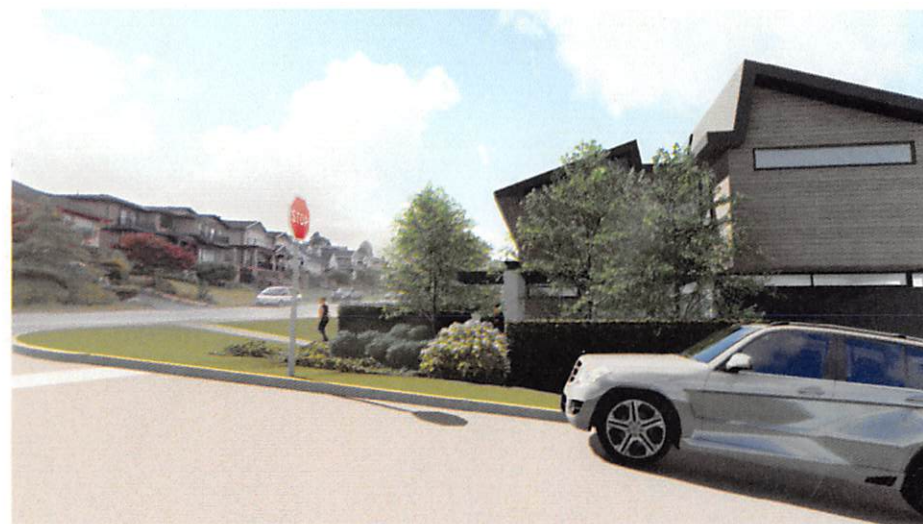
3D Street View B