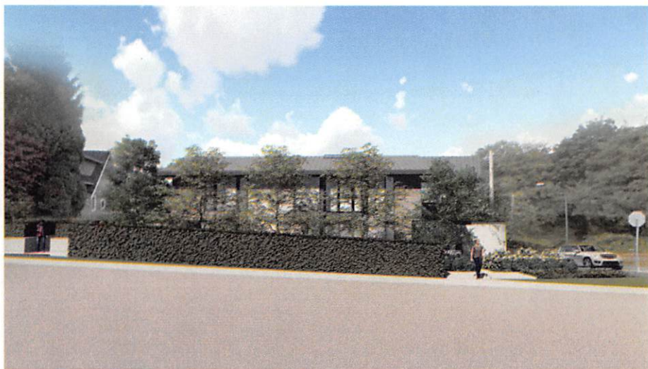
3D Street View C