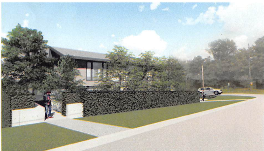
10 Street View 0