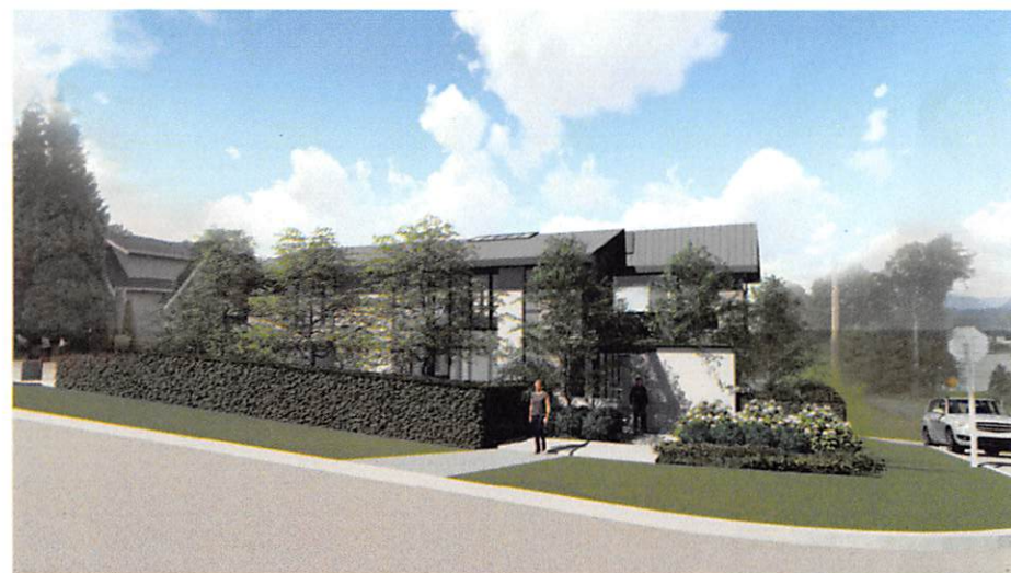
3D Street View A