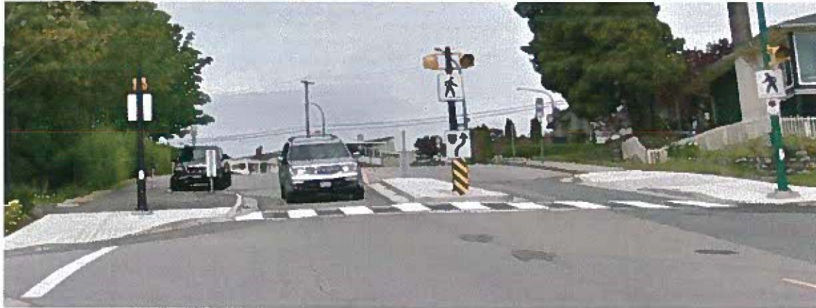
Figure 5: Existing Roadside-mounted Special Crosswalk at Beta Ave/Brentwood Dr