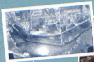
1951: A channel was dredged through the lake to increase water flow between Oak Creek, Deer Lake Brook, and the Brunette River.

Burnaby Lake is slowly filling with peat and shrinking, which is a natural part of the lake's lifecycle. Today's challenge is to allow this natural process to take place, while preserving the lake as an important habitat for fish and wildlife.