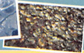
1966: The lake was being choked by silt and an invasive growth of water lilies. Much of the lake had less than 2 ft. deep of water cover in the summer months.