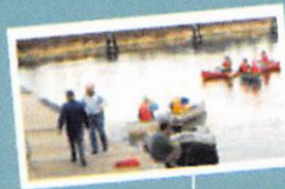
1970s: Cleanup events were held regularly. Beginning in the 1970s, the 1988 cleanup event attracted 12 community groups and over 100 volunteers.