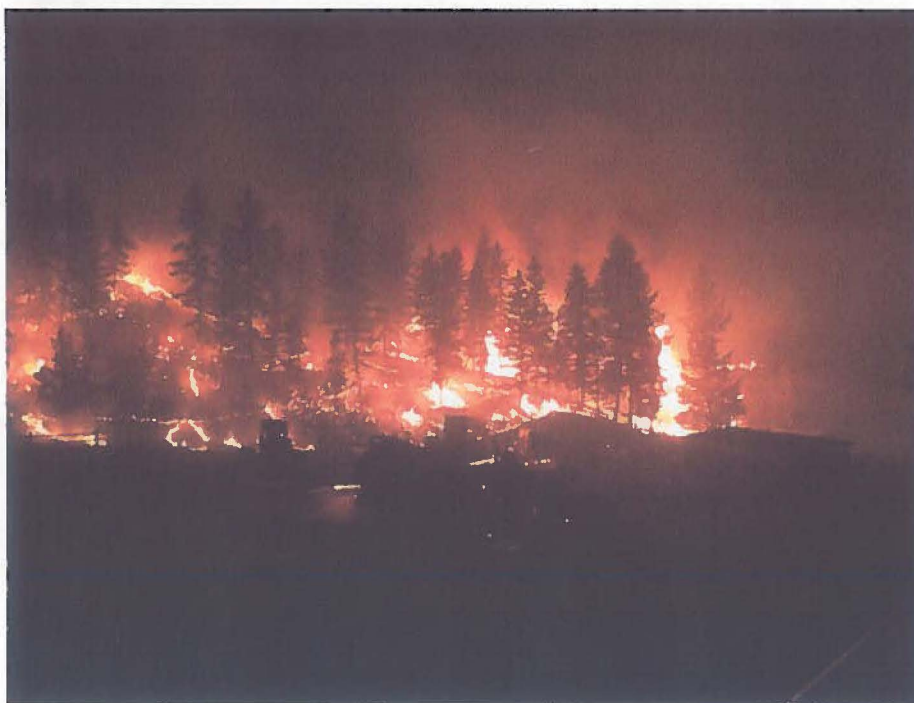
BFD on night operations protecting a ranch on Loon Lake Rd