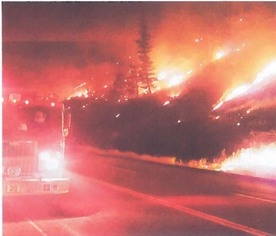
BFD on night operations on highway 97 between Cache Creek and Loon Lake Rd

To: Public Safety Committee From: Director Public Safety and Community Services Re: City of Burnaby Wildfire Support 2018 Jan 23..... Page 4