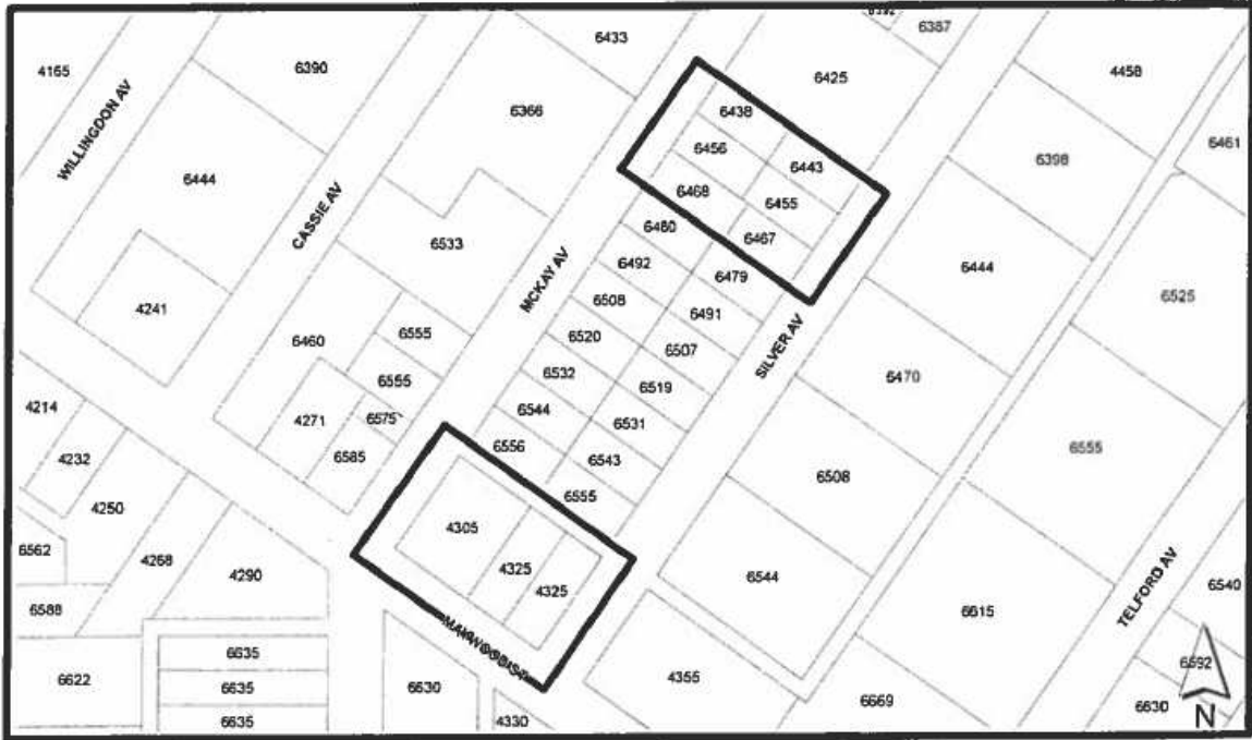
THE AREA(S) SHOWN ABOVE OUTLINED IN BLACK (——) IS (ARE) REZONED

FROM: R5 Residential District and RM3 Multiple Family Residential District