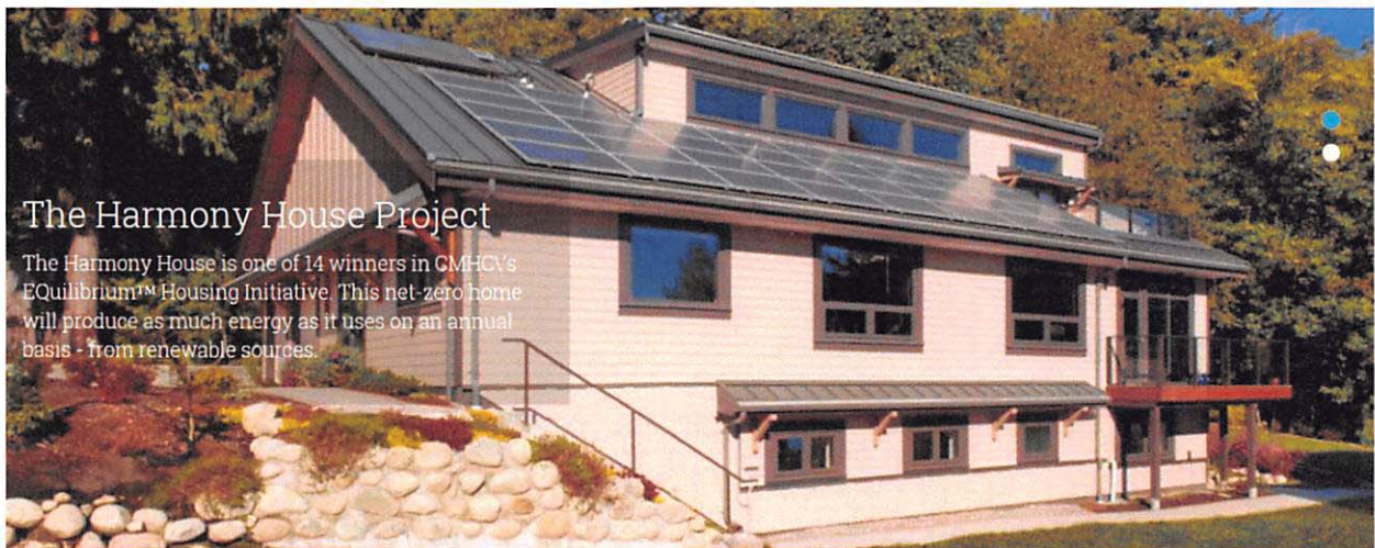
Harmony House (7990 Joffre Av. Burnaby): Net positive home, partially funded by CMHC Equilibrium program to demonstrate green approaches; grid-connected solar photovoltaic electricity, local materials, air source heat pumps. Beyond Step 5 equivalent in Energy Step Code https://www.cmhc-schl.gc.ca/odpub/pdf/67567.pdf