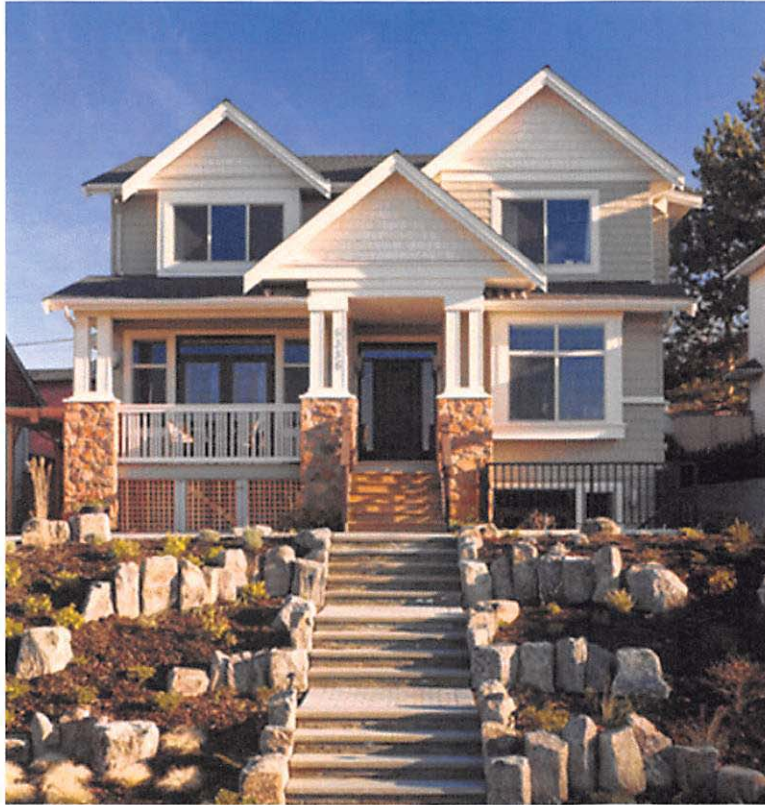
Strandberg-Legg Home (6336 Burns Av. Burnaby): built on homeowner initiative; LEED™ Gold and Energuide 84, equivalent to Step 4 of Energy Step Code . http://corostrandberg.com/about/coros-leed-gold-home/