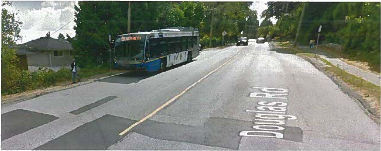
Figure 1 – Douglas Road, south of Laurel (existing)

To: Chair and Members Financial Management Committee From: Director Engineering Re: Road Upgrade Report Douglas Road, Sprott Street to Trans-Canada Highway (3037) 2018 March 06.....Page 2