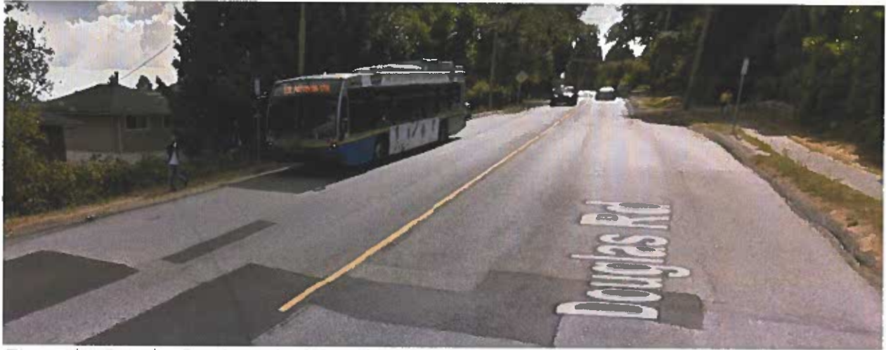
Figure 1 – Douglas Road, south of Laurel (existing)

To: Chair and Members Financial Management Committee From: Director Engineering Re: Road Upgrade Report Douglas Road, Sprott Street to Trans-Canada Highway (3037) 2018 March 06.....Page 2