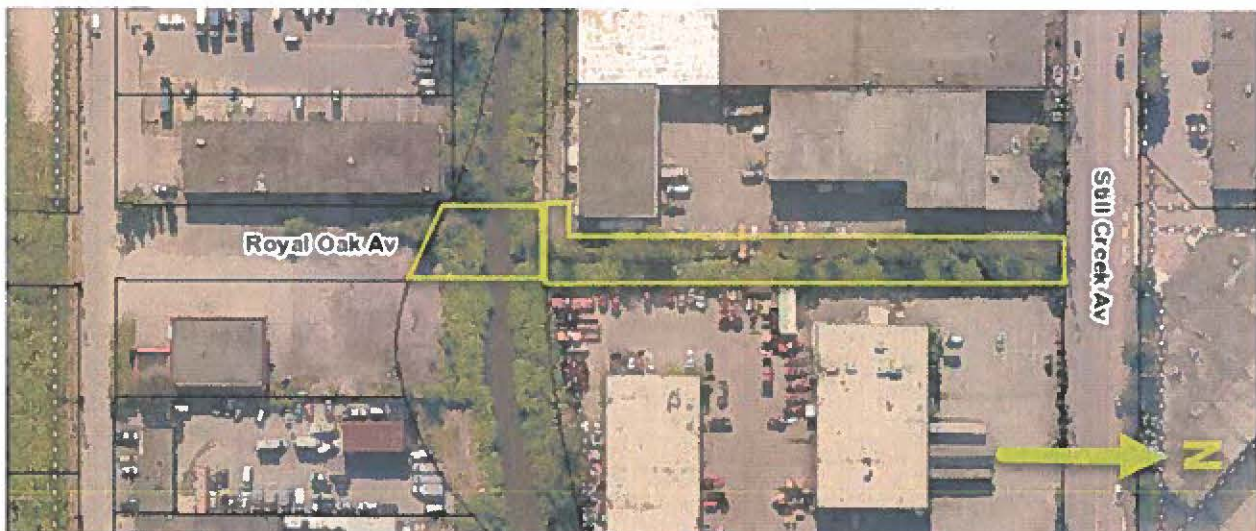
Figure 2 – Location of proposed Metro Vancouver watermain under Elk Creek

With respect to Project M1 – Still Creek Area, Metro Vancouver plans to install their watermain via deep micro-tunneling under Elk Creek, between Still Creek Avenue and Still Creek, in order to eliminate any environmental disturbance to this watercourse. Figure 2 shows Metro Vancouver’s proposed watermain in relation to Elk Creek. Metro Vancouver has submitted and received approval from the City’s Environmental Review Committee (ERC) on 2017 December 11 that this is an acceptable construction methodology.