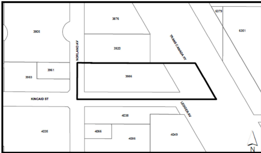
THE AREA(S) SHOWN ABOVE OUTLINED IN BLACK (——) IS (ARE) REZONED

LEGAL: Lot 53, except dedication plan 71549, DL 79, NWD District Plan 54758