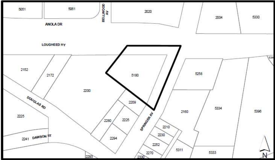
THE AREA(S) SHOWN ABOVE OUTLINED IN BLACK ( ——— ) IS (ARE) REZONED

LEGAL: Lot 4, DL 125, Group 1, NWD Plan 3674