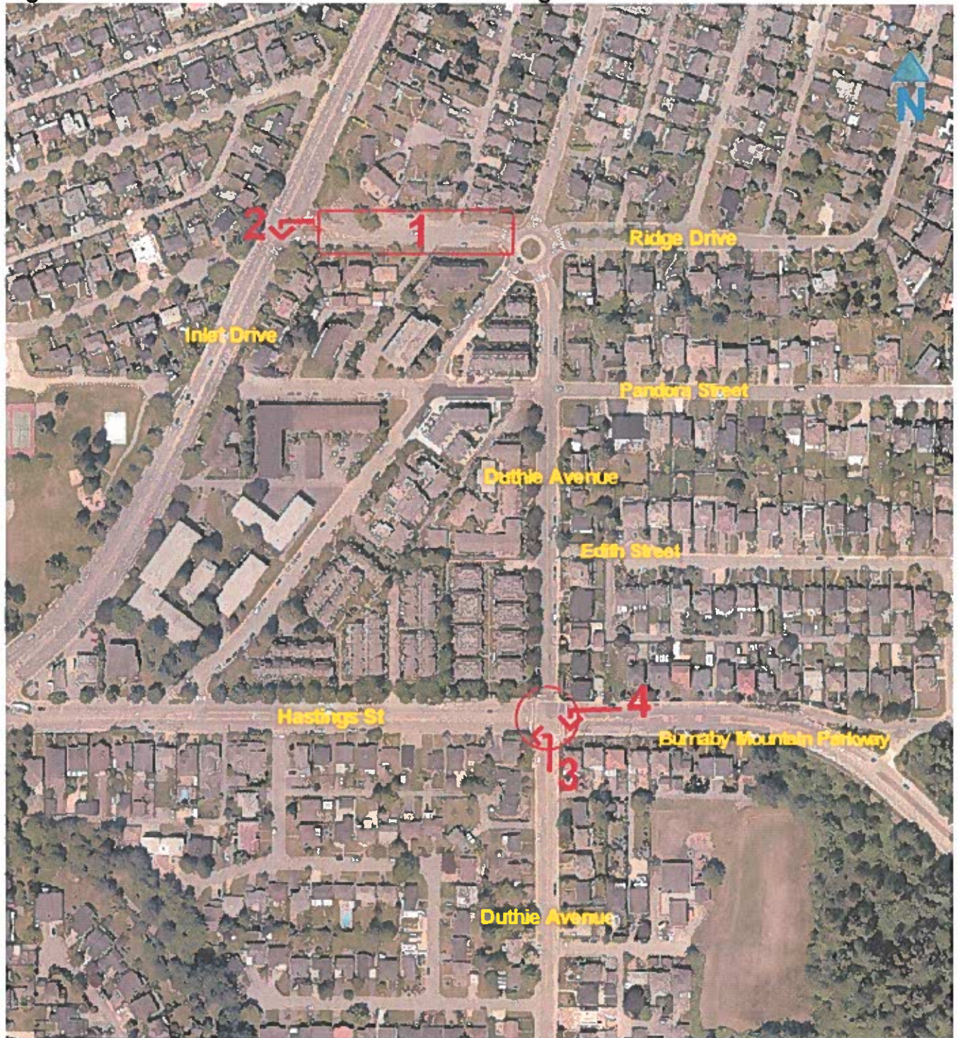
Figure 2: Location of Recommended Traffic Management Measures

To: Public Safety Committee From: Director Engineering Re: TRAFFIC CONCERNS ALONG DUTHIE AVE NORTH OF HASTINGS ST 2018 Sep 18..... Page 6