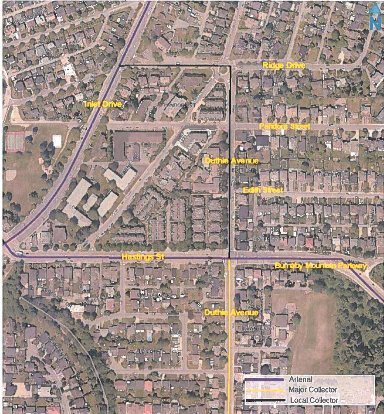
Figure 1: Site Location Map – Duthie Avenue from Hastings St to Inlet Dr

with the westbound left turn bay restricted to buses only during the AM weekday peak period.