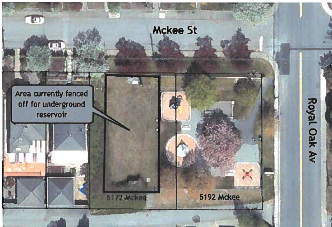
Figure 1 – Alta Vista Reservoir Site and Pre-School Playground

A 2016 report from an engineering consultant on the condition of the reservoir structure determined that the reservoir is at risk of failure in a seismic event and would need to be decommissioned in order to enable safe use of the site. Further, the existing cover of grass and soil on top of the reservoir is shallow, and could also restrict potential public use.