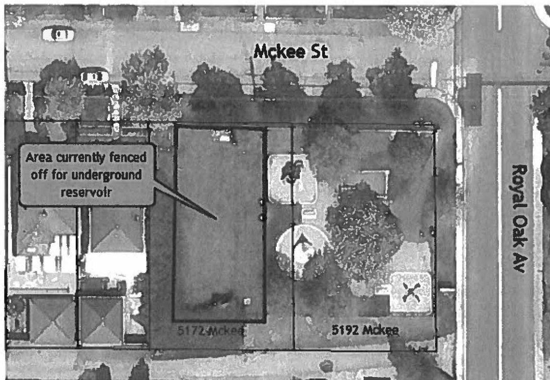
Figure 1 – Alta Vista Reservoir Site and Pre-School Playground

A 2016 report from an engineering consultant on the condition of the reservoir structure determined that the reservoir is at risk of failure in a seismic event and would need to be decommissioned in order to enable safe use of the site. Further, the existing cover of grass and soil on top of the reservoir is shallow, and could also restrict potential public use.