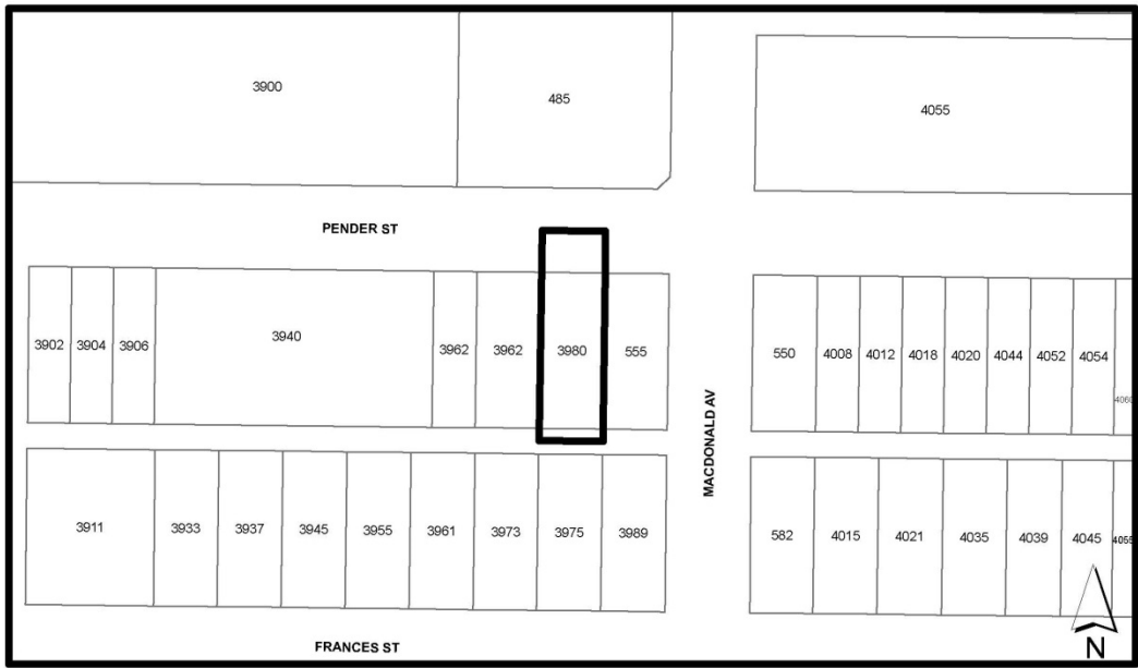
THE AREA(S) SHOWN ABOVE OUTLINED IN BLACK ( ——— ) IS (ARE) REZONED

LEGAL: Lot 9, Block 14, DL 116, Group 1, NWD Plan 1236