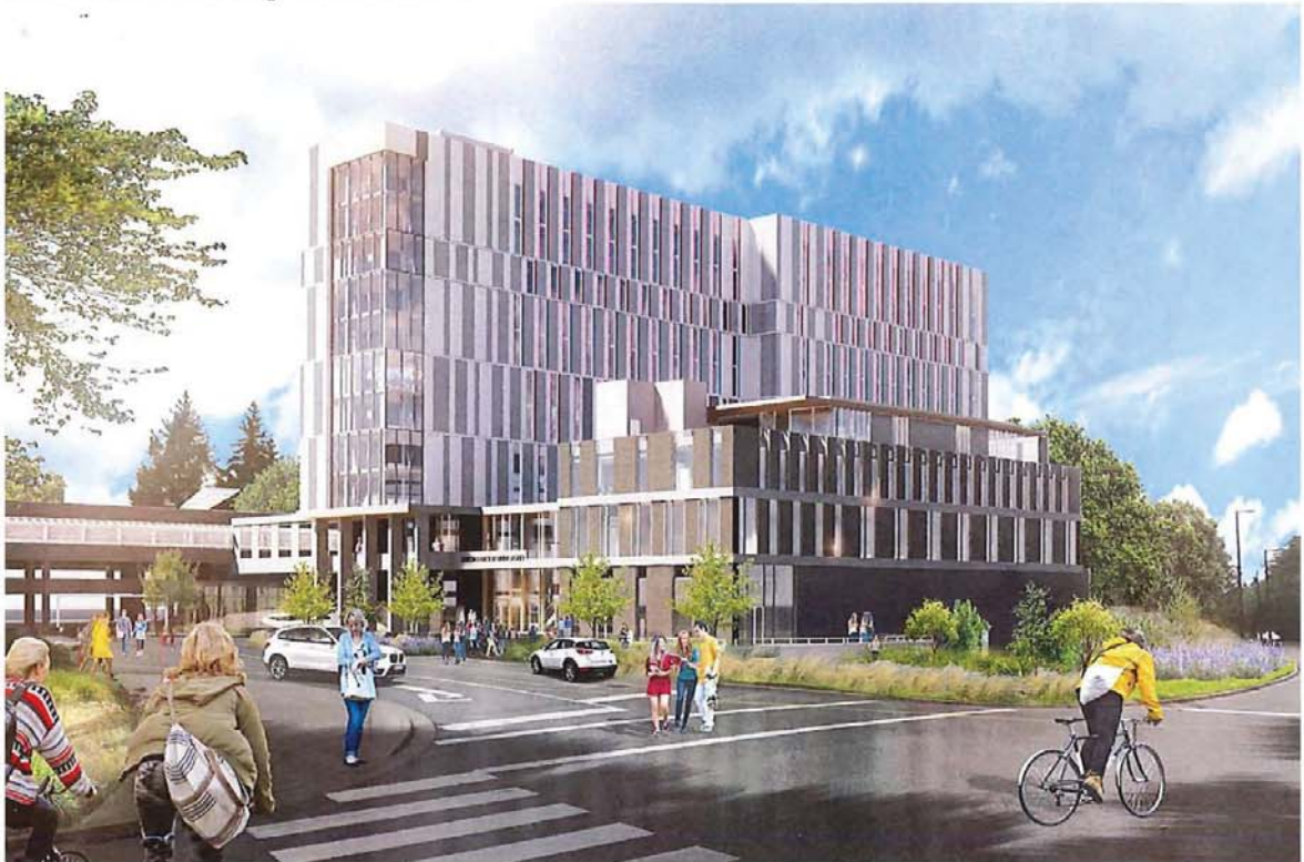
Proposed Replacement Building "Phase 2 Residences."