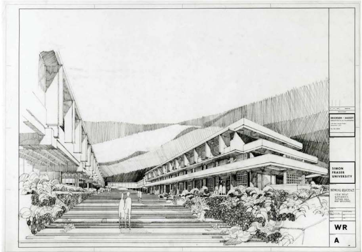
Original Rendering of Madge Hogarth House (Women's Residence) by Erickson Massey Architects.