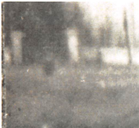
Detail of gate (enlarged historic photograph).