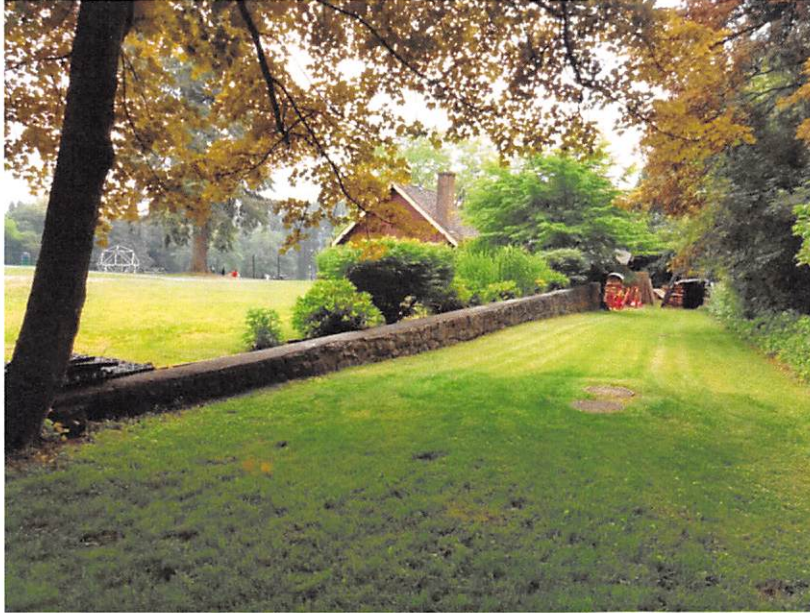
Existing Greenhouse Foundation Wall.