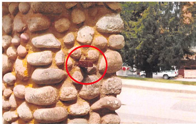
Cobblestone gate pillar. Note the anchor metal anchor that would have supported a metal gate.