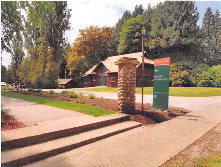
Pillar from gate marking the location of the upper driveway to the Fairacres Estate.