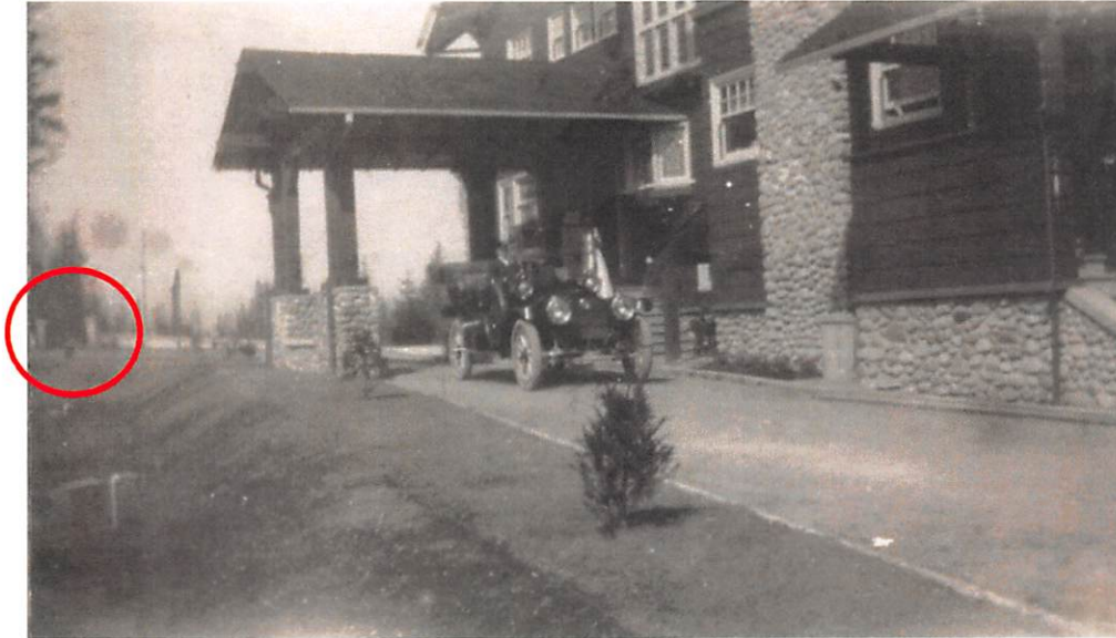
Note the estate gate visible in the background.