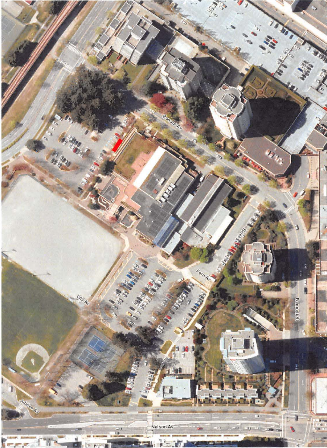
Location of proposed generator