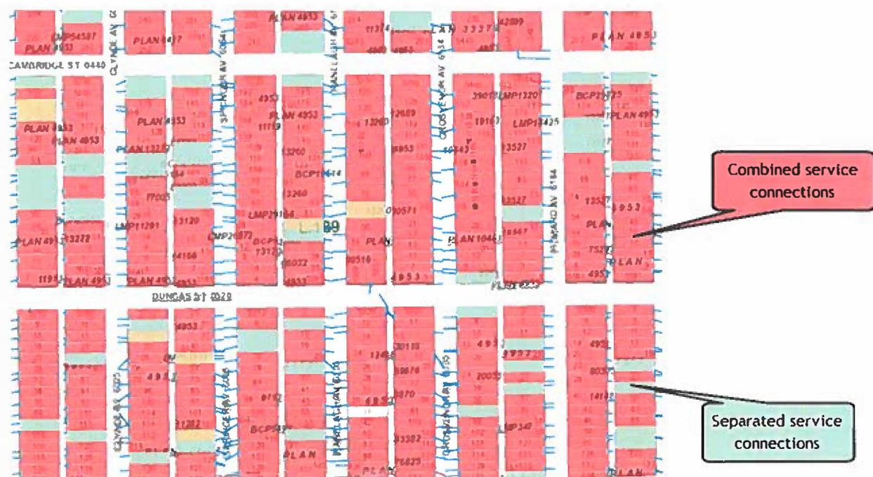
Figure 3 –Private-Side Separation Status in Burnaby (typical)

Properties undergoing redevelopment (ie. new house construction, or submission of a building permit valued at more than $250K) would not be eligible for the grant program, as per current practice, private-side separation would continue to be a condition of building permit approval. The grant would also only apply to properties within combined or previously combined areas, and where the City has already built separated sewers.