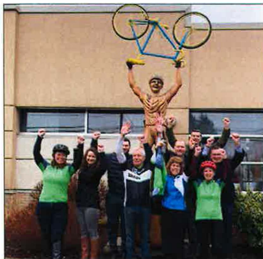
Ride to Conquer Cancer participants from Hope joined several others to celebrate the new statue to honour the annual ride.

In Hope in 2019, riders were greeted at the finish by an impressive chainsaw carving depicting a jubilant cyclist with bike held in the air. The statue has now been moved into its permanent location. An unveiling was held on Wednesday