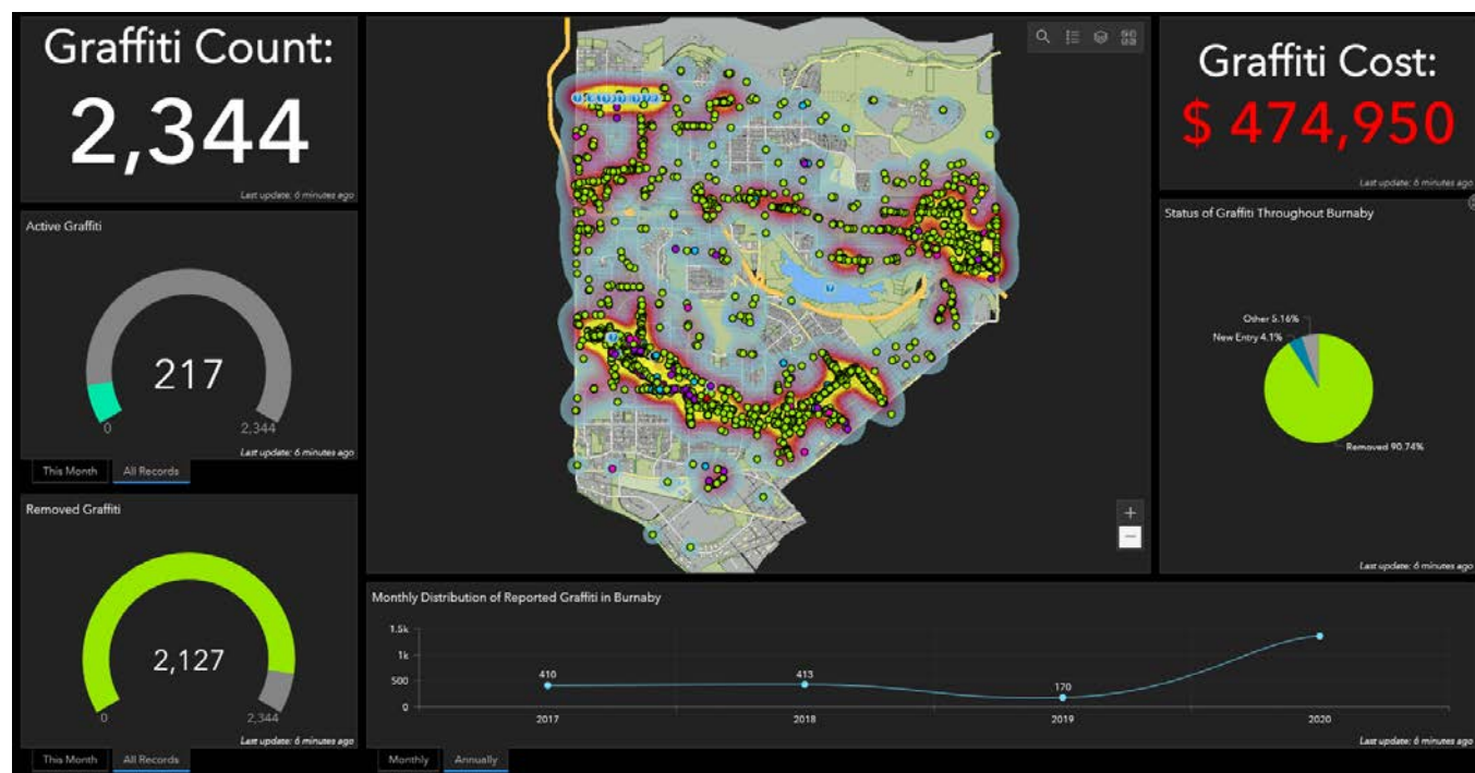
Dashboard showing graffiti statistics from 2017 to current date.

A sample of some of the information available from the program's dashboard is shown below: