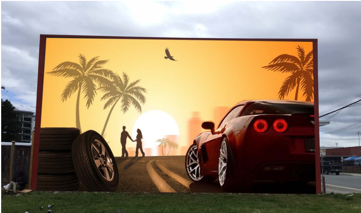
Mural at 7513 Edmonds Street (2020)

To: Chair and Members Public Safety Committee From: Director Engineering Re: 2020 Anti-Graffiti Program Update 2020 November 16.....Page 6