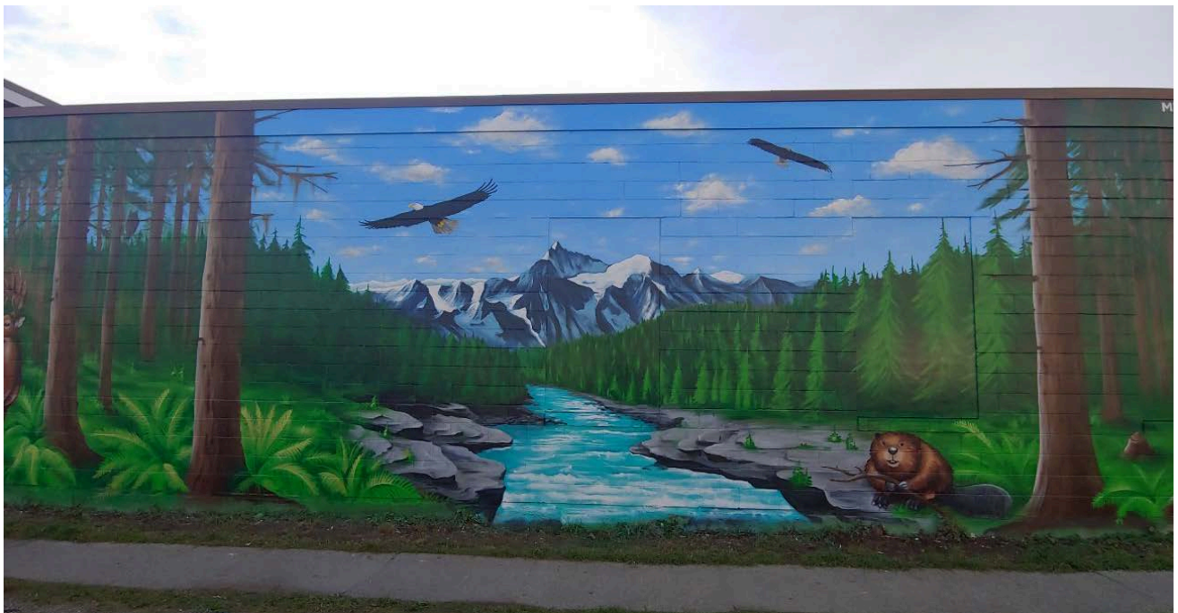
Mural at 5575 Short Street (2020)