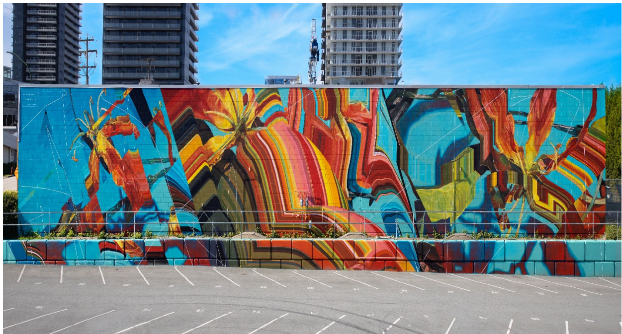
Mural at 2150 Alpha Avenue (2020)

Burnaby's mural program continues to be a pillar of graffiti prevention. The creation of street wall murals provides an effective graffiti prevention strategy while beautifying communities. In 2020 the program helped to support the creation of murals at 4 high graffiti locations. These are shown in the photos below.