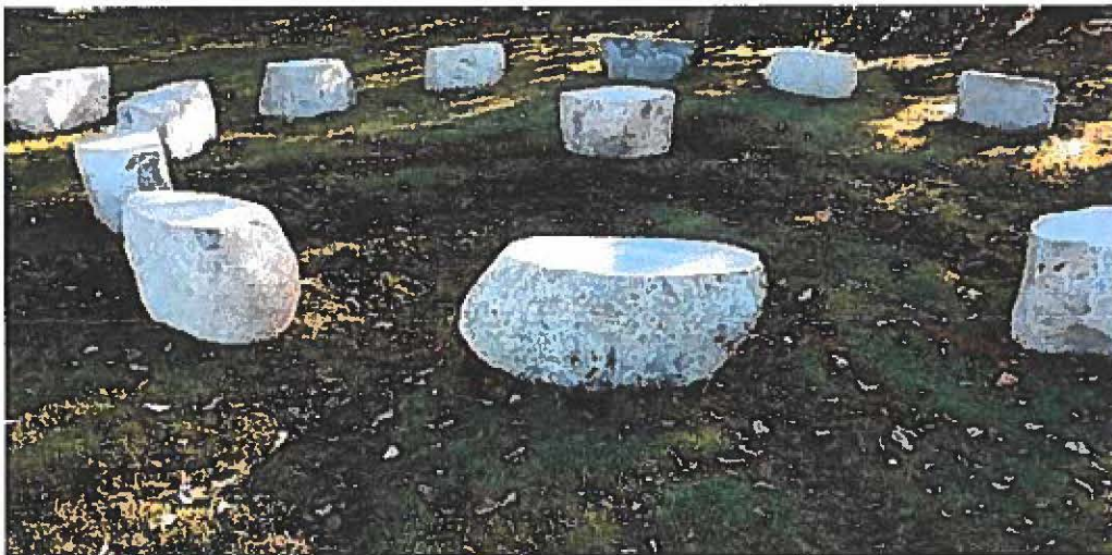
Example of proposed stone circle

The new Outdoor Learning Space will consist of a circle of ten river rock benches. The new space will provide an area for teachers to use in a variety of ways to increase outdoor learning opportunities for the whole student population. The new space will also provide an alternate location for play and physical activities.