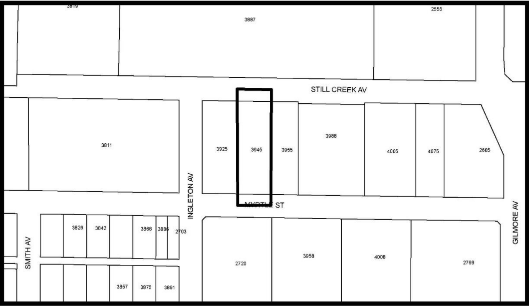
THE AREA(S) SHOWN ABOVE OUTLINED IN BLACK ( ——— ) IS (ARE) REZONED

LEGAL: Lot B, DL 69, Group 1, NWD Plan 17722