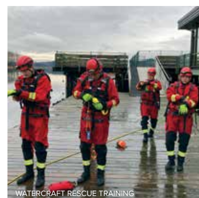
WATERCRAFT RESCUE TRAINING