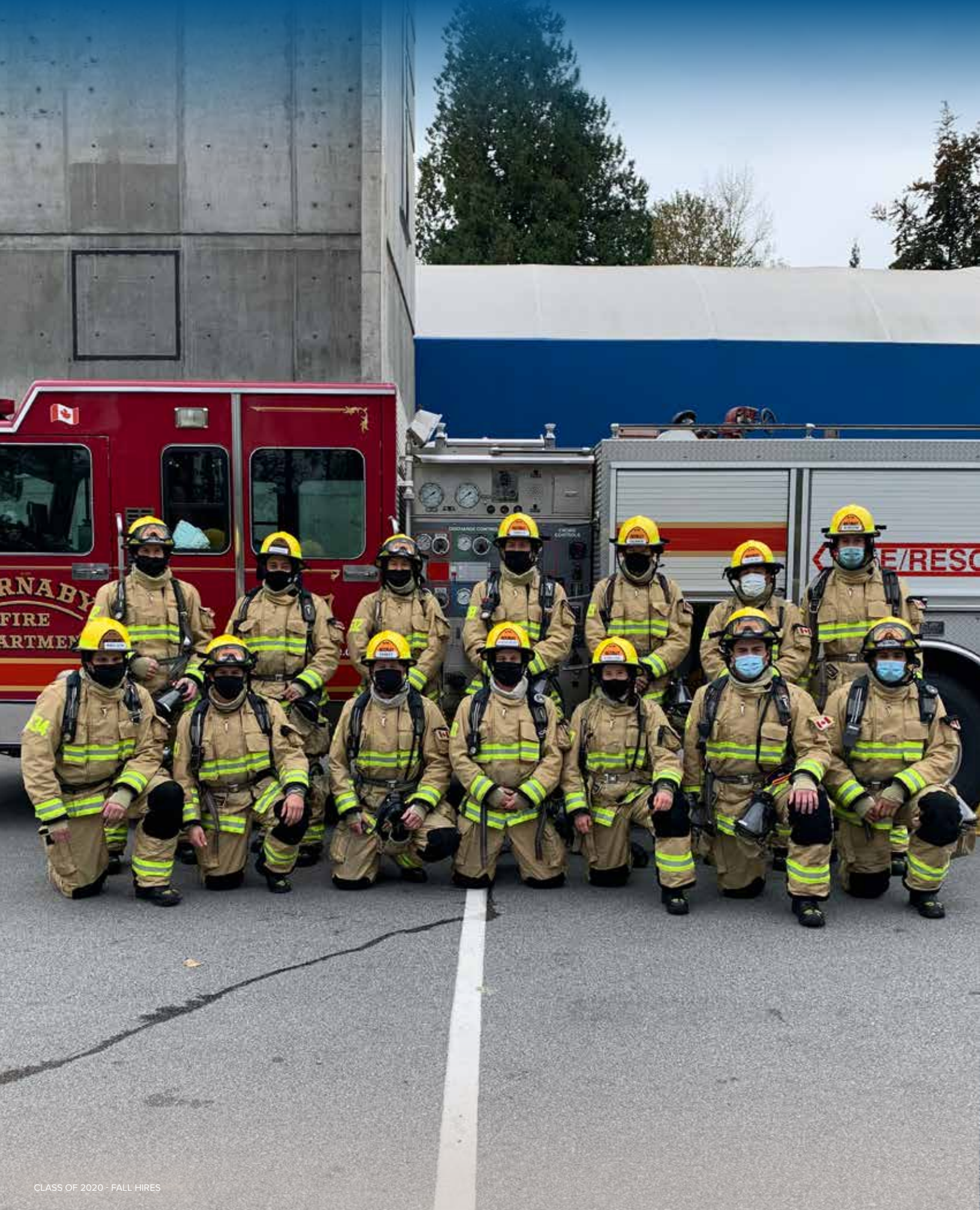
CLASS OF 2020 - FALL HIRES