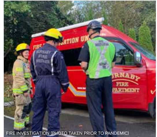
FIRE INVESTIGATION (PHOTO TAKEN PRIOR TO PANDEMIC)