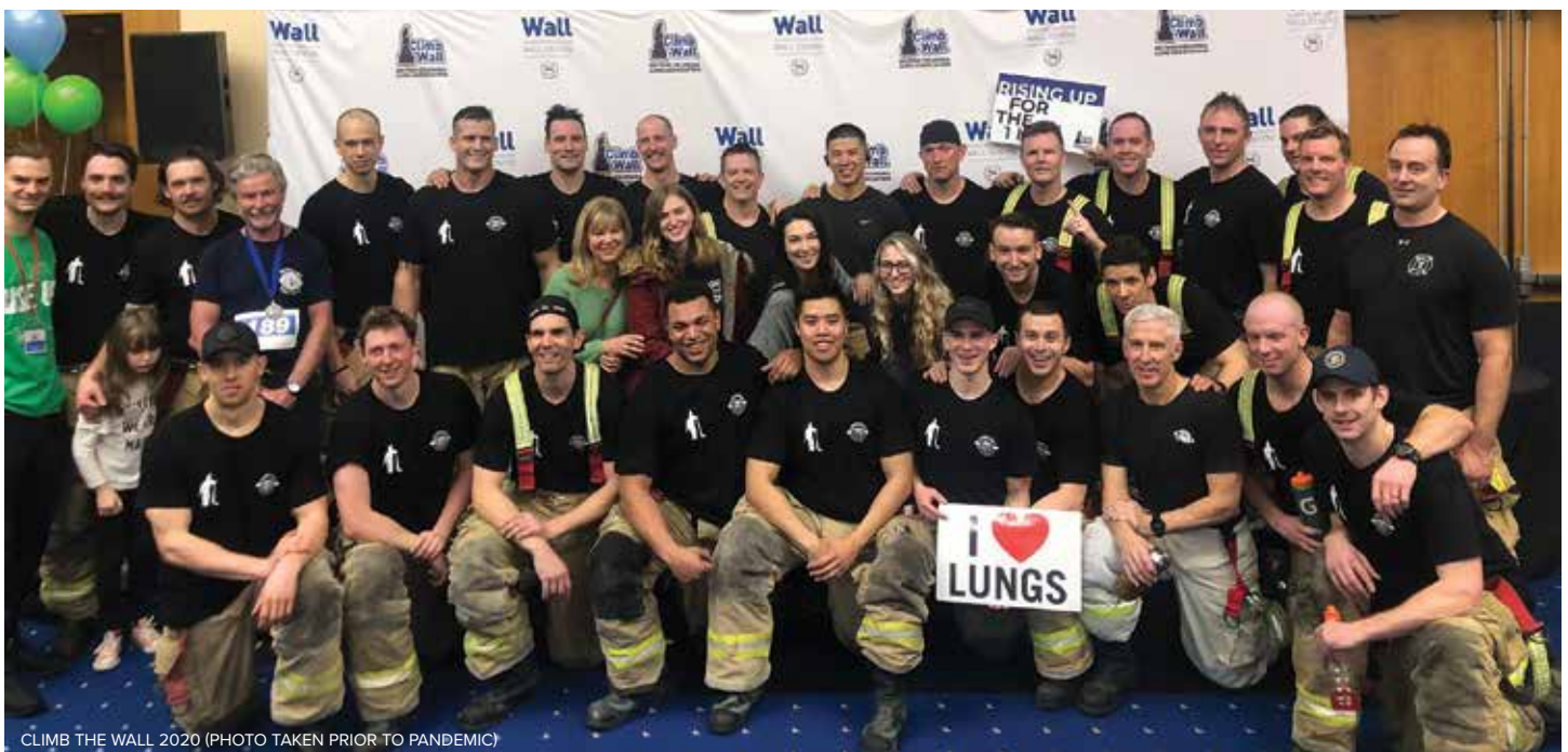
CLIMB THE WALL 2020 (PHOTO TAKEN PRIOR TO PANDEMIC)