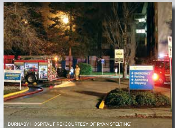
BURNABY HOSPITAL FIRE