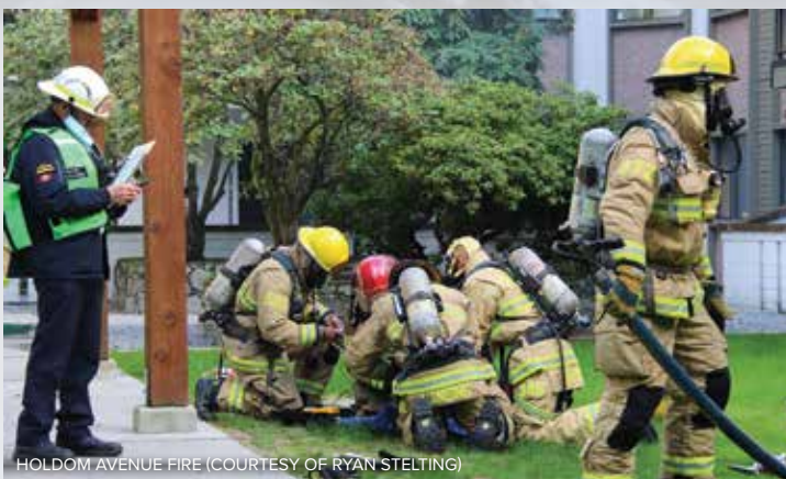
HOLDOM AVENUE FIRE