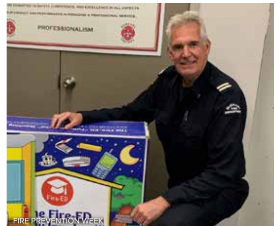
FIRE PREVENTION WEEK