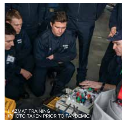
HAZMAT TRAINING (PHOTO TAKEN PRIOR TO PANDEMIC)