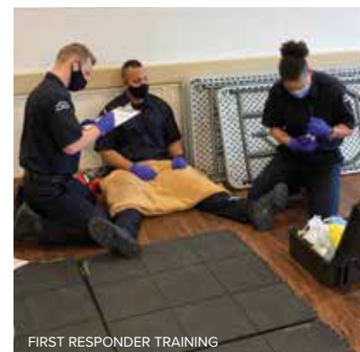
FIRST RESPONDER TRAINING