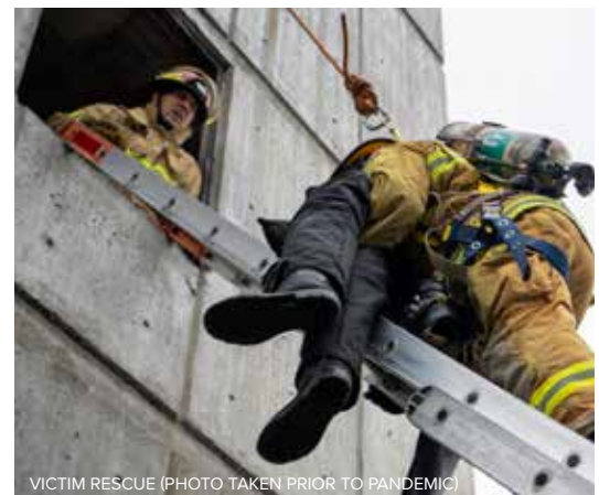
VICTIM RESCUE (PHOTO TAKEN PRIOR TO PANDEMIC)