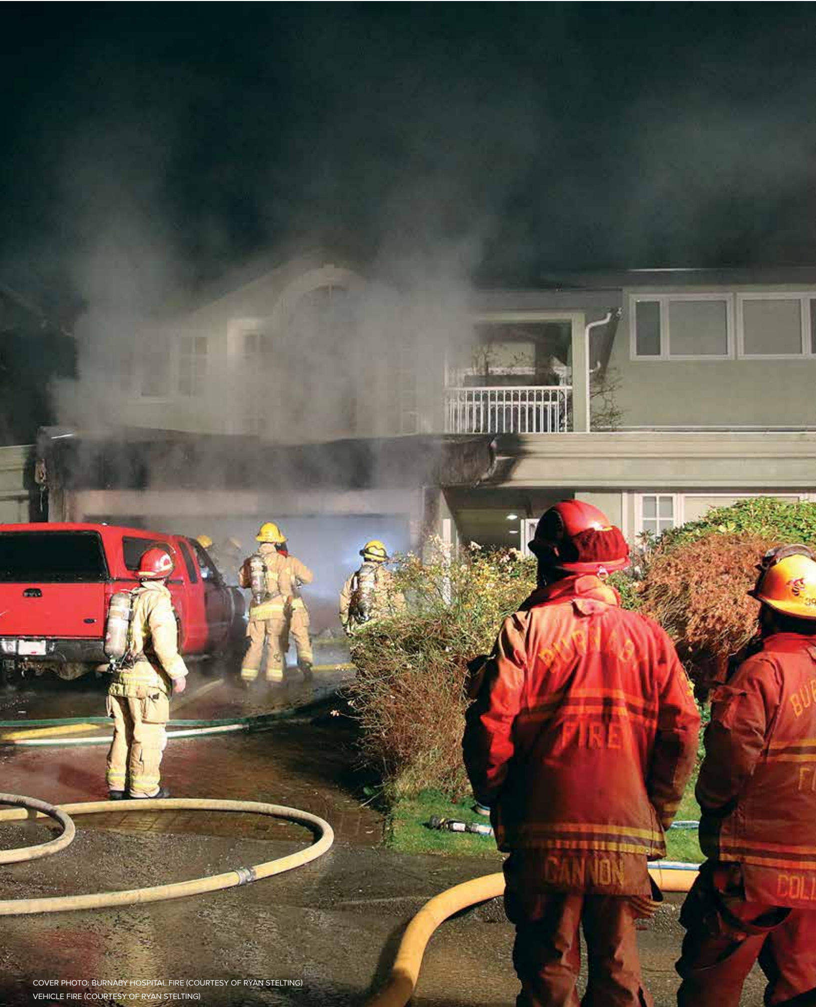
COVER PHOTO: BURNABY HOSPITAL FIRE (COURTESY OF RYAN STELTING) VEHICLE FIRE (COURTESY OF RYAN STELTING)