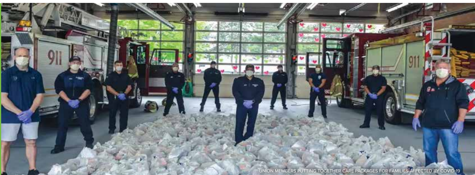
UNION MEMBERS PUTTING TOGETHER CARE PACKAGES FOR FAMILIES AFFECTED BY COVID-19