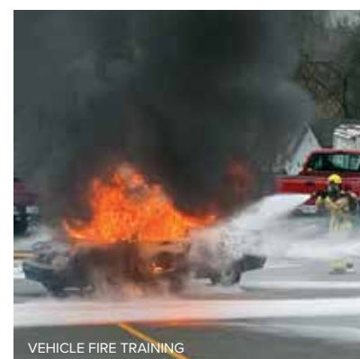
VEHICLE FIRE TRAINING