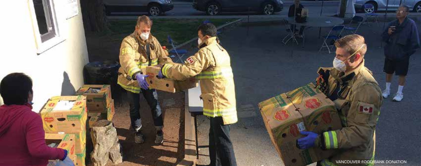
VANCOUVER FOOD BANK DONATION