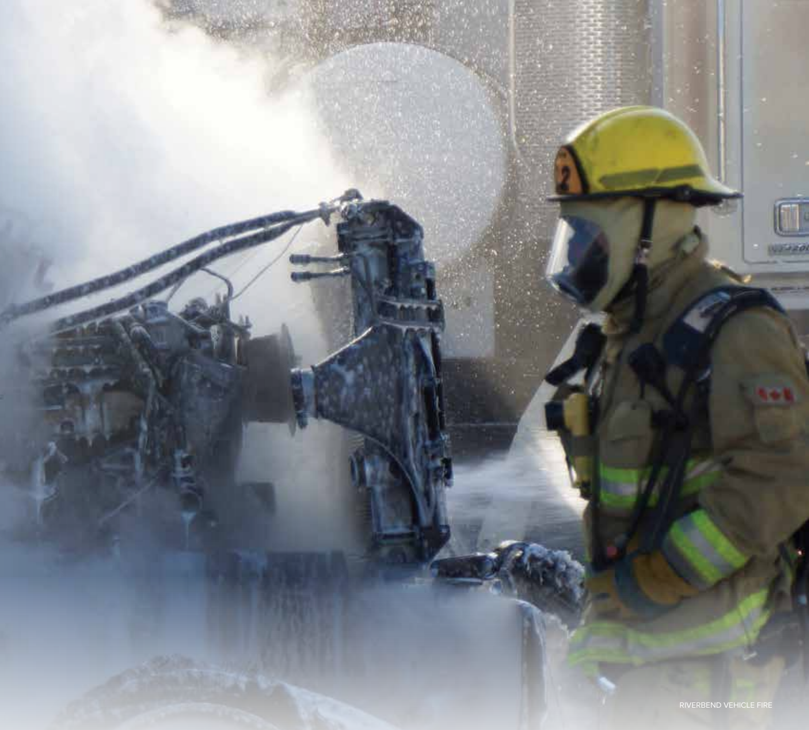
RIVERBEND VEHICLE FIRE