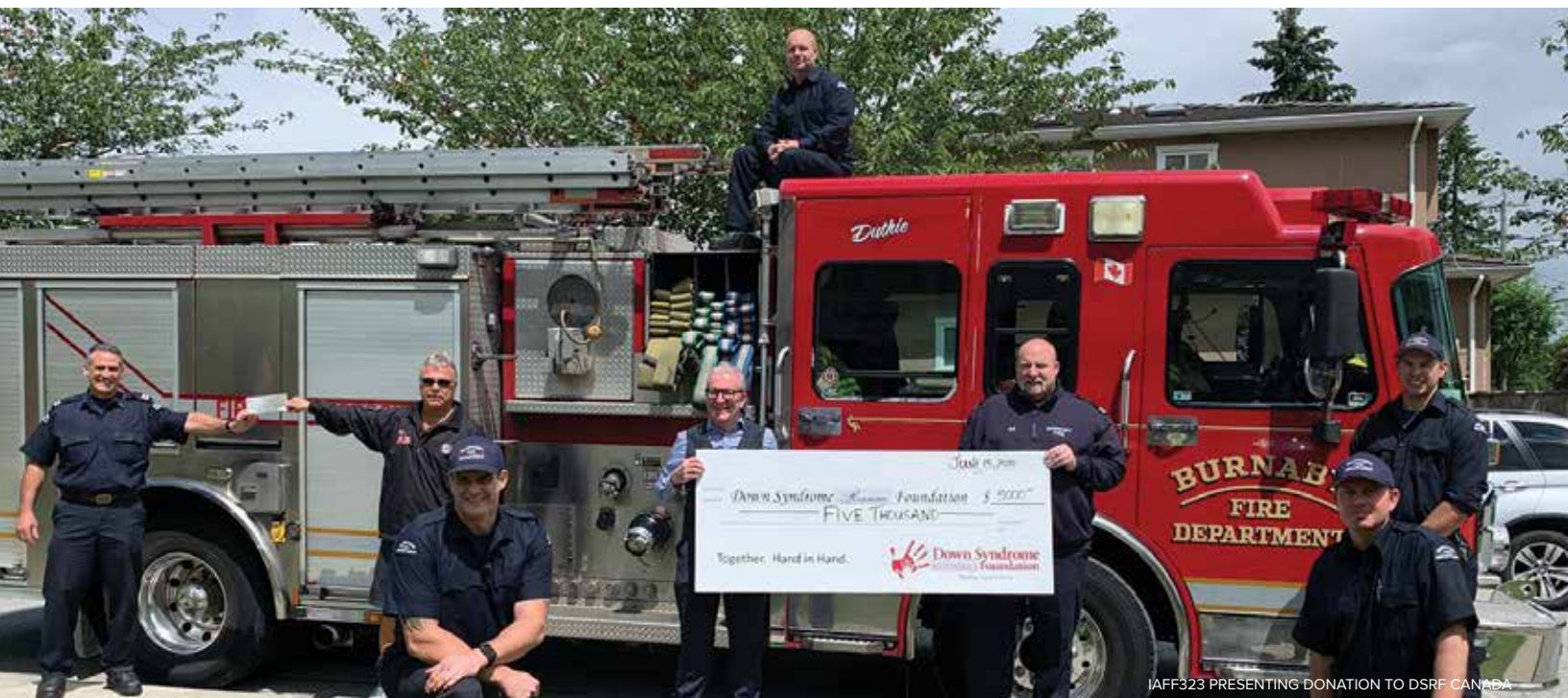
IAFF323 PRESENTING DONATION TO DSRF CANADA