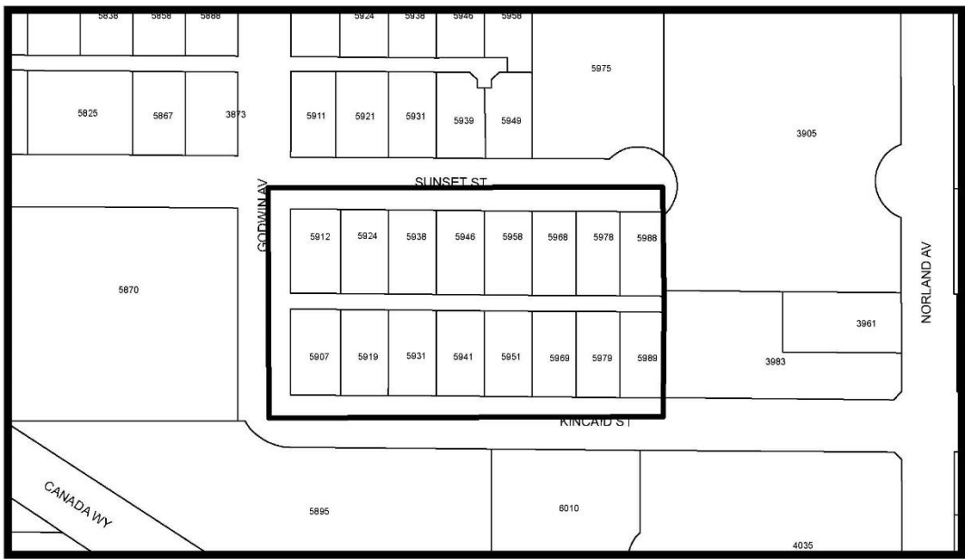
THE AREA(S) SHOWN ABOVE OUTLINED IN BLACK ( — ) IS (ARE) REZONED