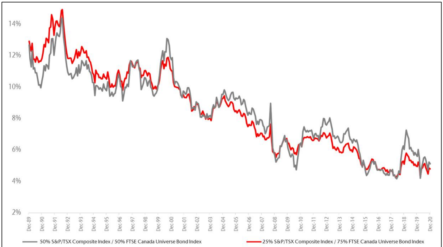
Graph 2: Rolling 10-Year Periods

As experienced in 2020 March, equities and other investment assets dropped significantly, between 30% and 40%, depending on the index and sector. As asset prices started dropping, skittish investors fled the market, which increased market volatility and compounded the continued downward spiral. History has taught us time and time again that selling investments during these sharp contraction periods is ill advised, yet history is also full of stories of both retail and sophisticated investors making impulse decisions to sell and crystalize losses. In March/April of 2020, like many time periods in the past, those investors that stayed the course and stuck to their original investment goals of holding for the long term have seen their growth assets recover and grow more. In the most recent case, it took just 18 months.