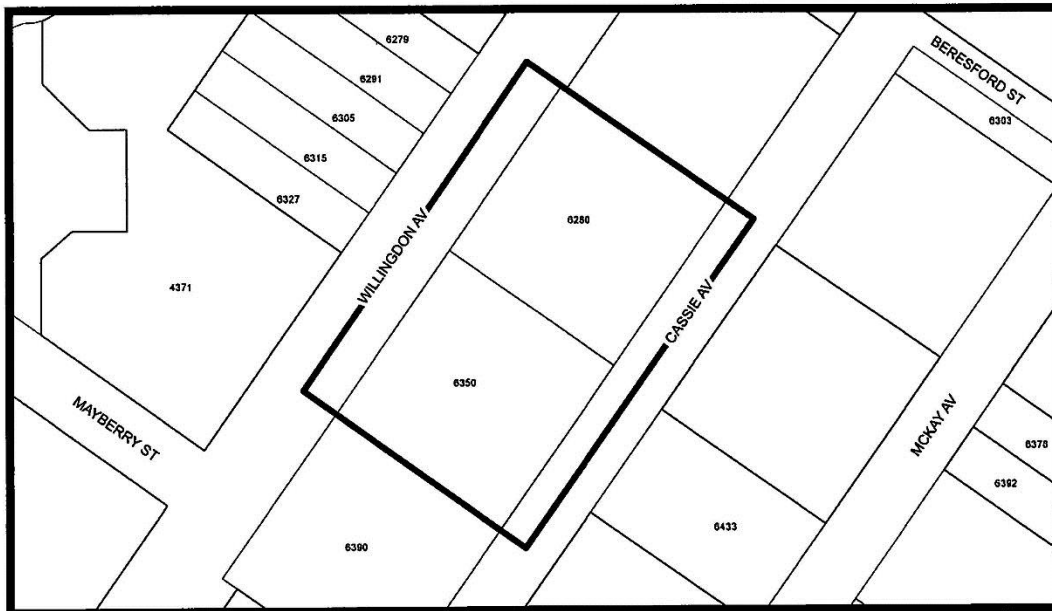
THE AREA(S) SHOWN ABOVE OUTLINED IN BLACK (——) IS (ARE) REZONED

LEGAL: Lot "E" And "F" District Lots 151 And 153 Group 1 New Westminster District Plan 2069