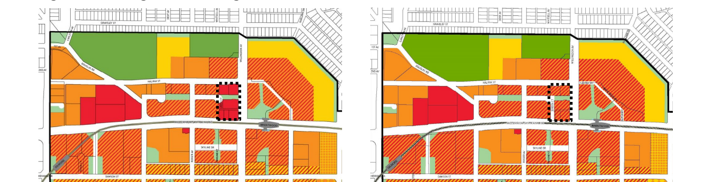
Figure 3 - Proposed Community Plan Amendment

The opportunity provided by the redevelopment of the subject site is to transform this underutilized commercial, and partially vacant site, in the heart of the Brentwood Town Centre into an activity hub that maximizes its strategic location in proximity to the Brentwood SkyTrain Station and major commercial and residential nodes. A fundamental goal for the Brentwood West site is the