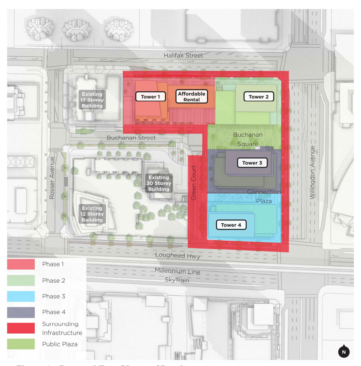
Figure 4 - Proposed Four Phases of Development

would be brought forward as a single, or related grouping of site specific rezoning applications. Upon completion, the approximately 3.27 acres (142,542 sq. ft.) site is envisioned to accommodate four mixed-use residential and commercial towers, two new public open spaces, a new street linking Buchannan Street to Lougheed Highway, and a range of public realm and infrastructure upgrades, including the achievement of the Town Centre Street Standards along the development frontages. The following is a brief overview of the proposed phases of development.