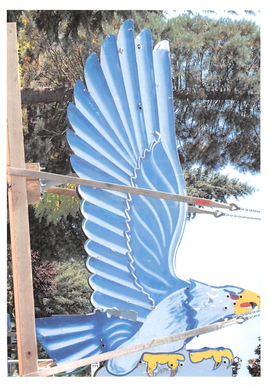
The Eagle Ford neon sign when it was purchased by the City of Burnaby in 2012. Burnaby Village Museum BV016.18.2