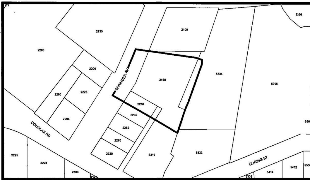
THE AREA(S) SHOWN ABOVE OUTLINED IN BLACK ( ——— ) IS (ARE) REZONED

LEGAL: Portion of Lot 51 Except Part Subdivided by Plan 43624 District Lot 125 Group 1 New Westminster District Plan 40102; Lot 1 District Lot 125 Group 1 New Westminster District Plan 12069; and Portion of Lot 54 District Lot 125 Group 1 New Westminster District Plan 43624