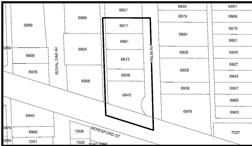
THE AREA(S) SHOWN ABOVE OUTLINED IN BLACK ( ——— ) IS (ARE) REZONED