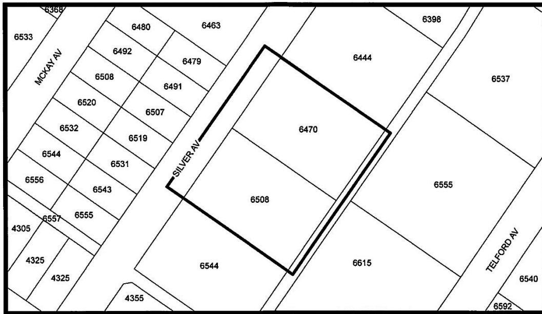
THE AREA(S) SHOWN ABOVE OUTLINED IN BLACK (——) IS (ARE) REZONED

LEGAL: Lot 75 District Lot 153 Group 1 New Westminster District Plan 29123; and Lot 76 District Lot 153 Group 1 New Westminster District Plan 29123