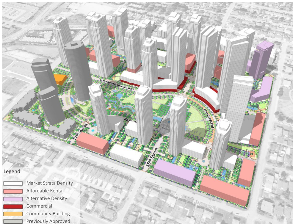
Figure 4: Massing and uses view from the east

The additional density proposed follows standard urban design planning principles whereby the towers step up towards the park, to frame the central feature of Southgate. At the edges of the community, in order to best transition with surrounding neighbourhoods, are lower buildings generally up to six storeys.