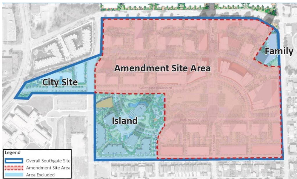
Figure 2 – Map showing areas removed from Master Plan Amendment Site Area

2.5 As shown in Table 1, the permitted residential density includes the remaining available RM5 and RM1 GFA from the entire Master Plan Site, excluding the City Site which will be developed independently. The remaining maximum GFA noted in the upper portion of Table 1 accounts for the RM5 and RM1 Density that was already approved as part of earlier phases of the Master Plan. The RM5r and RM5 Offset densities are only being applied to future development phases within the Amendment Site Area in order to meet the Rental Use Zoning Policy.