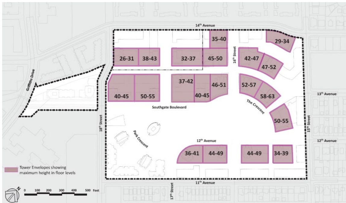
Figure 3: Tower envelopes and maximum heights in number of floors.

The proposed massing, heights, tower siting and forms have changed for the Amendment Site Area in order to accommodate the required additional non-market inclusionary rental density and associated offset density (see Figures 3 and 4 below).