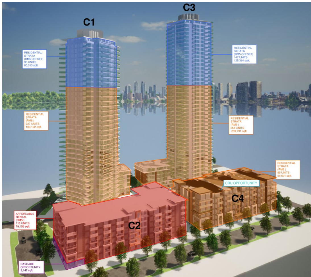
Figure 6: Phase 1A (C1 and C2) and Phase 1B (C3 and C4)

A total of 934 residential dwelling units are proposed, comprised of 819 market strata units (576 units utilizing RM5 Base and Bonus Density + 243 units utilizing Density Offset) and 115 non-market rental units (20% below CMHC median). Further, the non-market rental building includes a 199.37 m 2 (2,146 sq.ft.) childcare facility and the C3 Tower includes an optional 137.87 m 2 (1,484 sq.ft.) commercial retail unit (CRU) at the northeast corner. In the event that the CRU is not pursued, the area would be residential amenity space.