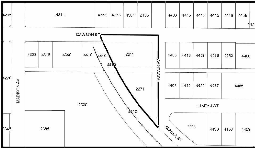
THE AREA(S) SHOWN ABOVE OUTLINED IN BLACK (——) IS (ARE) REZONED

LEGAL: Lot 33 District Lot 119 Group 1 New Westminster District Plan 34764; and Lot 48 District Lot 119 Group 1 New Westminster District Plan 40447