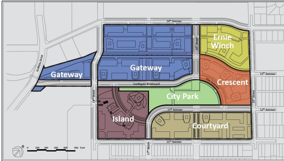
Figure 1 - Map showing Southgate's neighbourhood areas and original site area