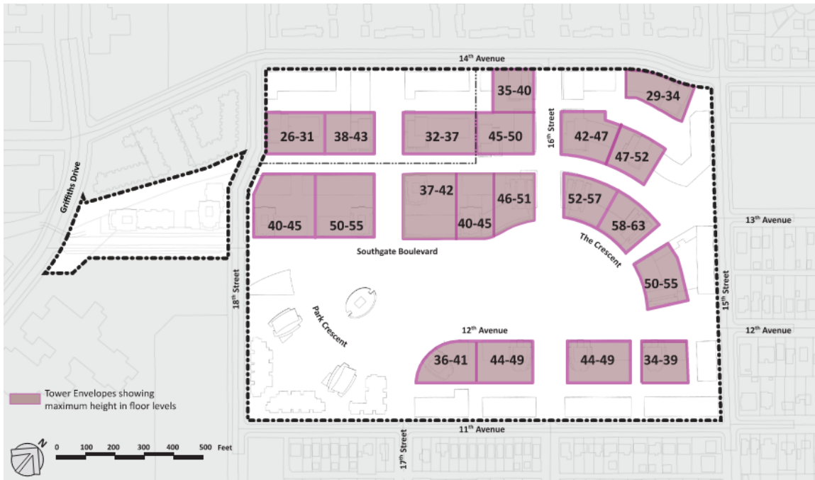
Figure 3: Tower envelopes and maximum heights in number of floors