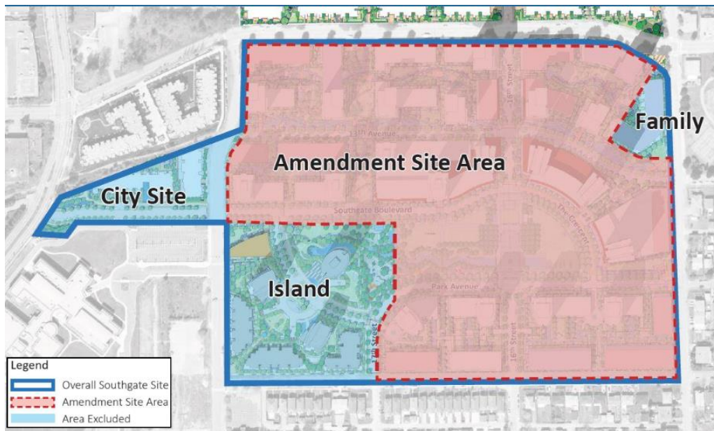
Figure 2 – Map showing areas removed from Master Plan Amendment Site Area

2.5 As shown in Table 1, the Amendment Site Area includes the available Multiple-Family (market) RM5 and Alternative density RM1 that remains after subtracting the City Site, the Family Site (from within the Ernie Winch neighbourhood) and Island neighbourhood. The remaining floor area, to a maximum of 5,006,586 sq. ft. residential gross floor area, is permitted within the Amendment Site Area, which is not inclusive of RM5r and RM5 Offset density.